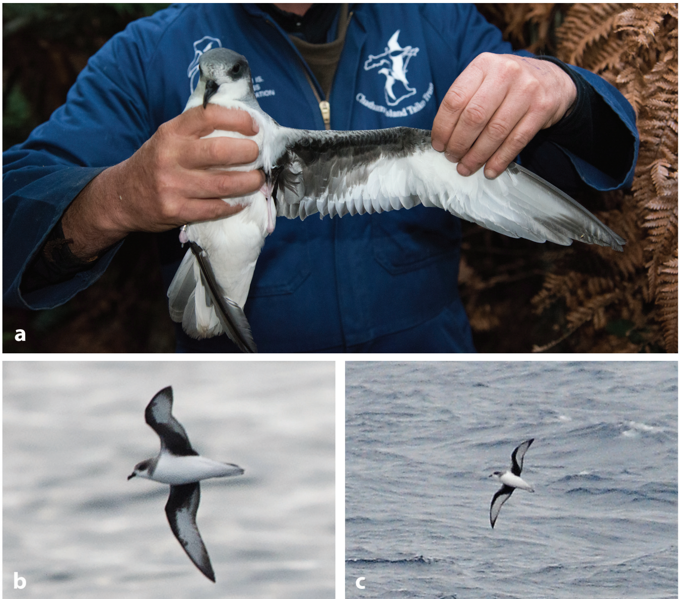
Fig. 1. Chatham Petrels: (a) Sweetwater Reserve, main Chatham Island, 15 January 2016 (Photo: Kirk Zufelt); (b) 9 km south of Rangatira Island, Chatham Islands, 18 January 2016 (Photo: Kirk Zufelt); (c) 39°39.5'S, 179°58.6'E, 264 km east of Napier, North Island, NZ, 12 January 2016 (Photo: Martin Gottschling).

The underwing pattern of Chatham Petrel is diagnostic. It has a thick, blackish leading edge to the inner forehand, and a long, broad diagonal ulnar bar, which, uniquely, extends to the wing base because of the blackish axillaries (Figs. 1a–c, 2c). Photographs of birds in the hand show that the forearm has whitish feathering restricted to a fine triangle of marginal and shorter lesser coverts along the inner half (base of triangle at the body), and the rear of the arm has a wider-based triangle of mainly median and greater