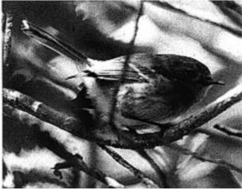
FIG. 3. Juvenile Kaua'i 'Elepaio.

cies, this cosmopolitan species may be a post-Polynesian colonizer of the Hawaiian Islands (Olson and James 1991).