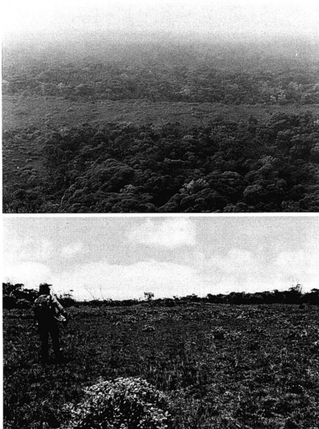
FIG. 1. Sincok's Bog as viewed from the air (upper) and from ground level (lower) with HDP in the foreground.