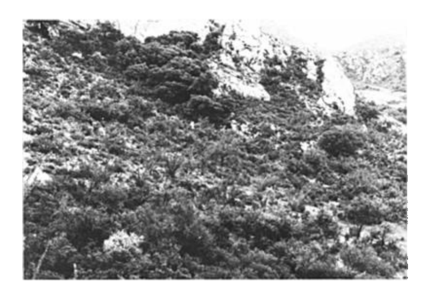
Habitat of Five-striped Sparrows in Chino Canyon, Santa Cruz County, Arizona, 20 August 1977.