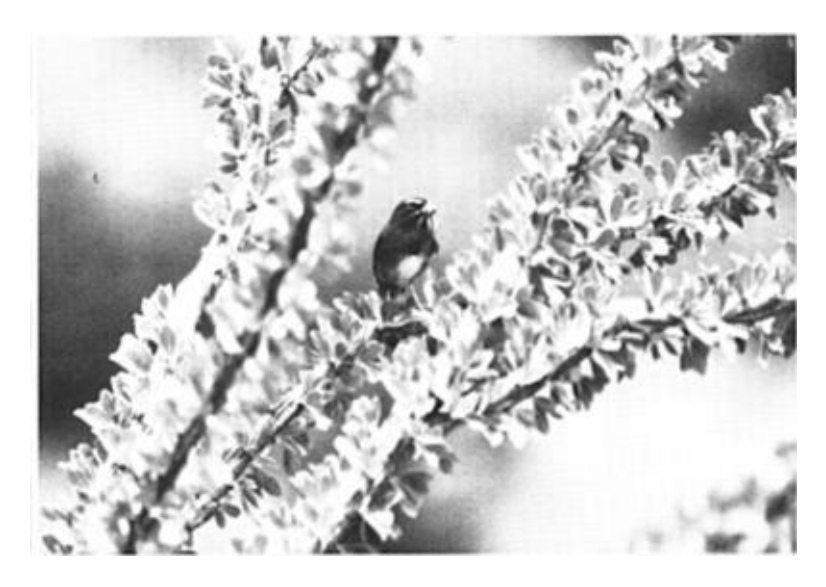
Male Five-striped Sparrow (Aimophila quinquestriata) with caterpillar in Ocotillo near Patagonia 31 July 1974.