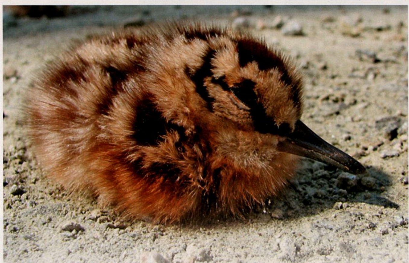
This American Woodcock chick was one of three young observed with an adult in Pittsylvania County, Virginia 25 March 2007, while the photographer was off the beaten birding track, looking for orchids. Young of this retiring species are seldom observed and even more rarely documented.