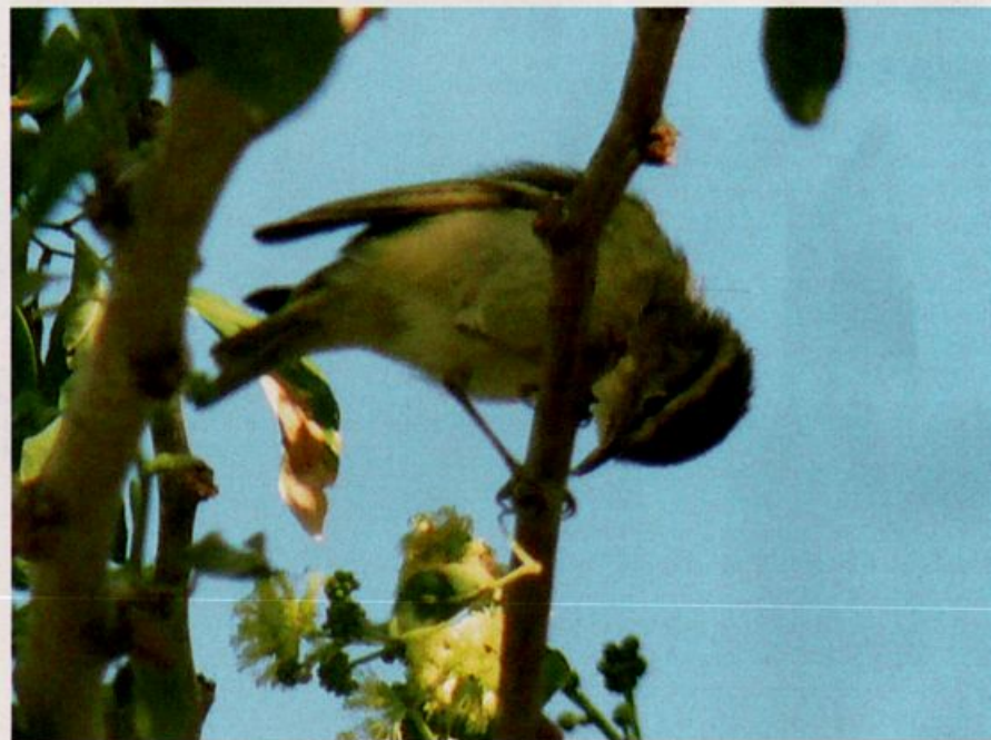
Figure 3. Yellow-browed Warbler preening in a Guamuchilar at Miraflores, Baja California Sur, 25 March 2007. This pose shows the solid crown and face pattern typical of this species. Note also the pale proximal half to the mandible and somewhat pale legs. This photograph, and others taken on 25 March, portray a yellowish cast to the underparts that is an artifact of lighting. In real life, the bird appeared mostly whitish beneath.

The bird's small size, bright wingbars, white tertial tips, and plain crown eliminate all species except Yellow-browed Warbler and Hume's Leaf-Warbler ( Phylloscopus humei ). Visual criteria for separating Yellow-browed and Hume's Leaf-Warblers are detailed by Baker (1997) and generally supported by the species' accounts in del Hoyo et al. (2006); these firmly point to its identification as a Yellow-browed Warbler, rather than a Hume's (see Figures 3-5):