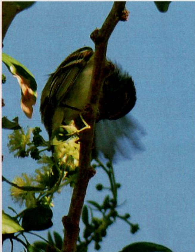
Figure 4. Yellow-browed Warbler at Miraflores, Baja California Sur, 25 March 2007. Here the bird shows its wing fairly well. Note the bold wingbars with a blackish base to the greater wing-coverts (forming a dark panel between the wingbars) and to the secondaries (forming a dark bar behind the second wingbar). Also note the bright greenish-yellow edges to the secondaries beyond this dark bar and bright white edge to the one visible tertial.

Island, Alaska (Lehman 2000a, 2000b). The second North American record was also from Gambell on 30 August 2002 (Lehman 2005). Most interesting are two additional sightings from the fall of 2006: one photographed at Attu Island, Alaska on 21 September (Tobish 2007) and a sight record from Milwaukee County, Wisconsin on 21 October that has been accepted by the Wisconsin Bird Records Committee as a single-observer sight record and thus hypothetical (Svingen 2007).