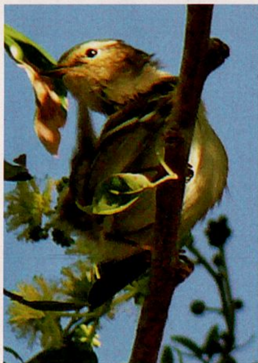
Figure 5. Yellow-browed Warbler at Miraflores, Baja California Sur, 25 March 2007. This photo best illustrates the pinkish basal half to the mandible and pale legs/feet.

would be worthwhile to look at the other species of Phylloscopus that have occurred in Alaska but have not yet been detected elsewhere on the continent. There have been two Wood Warblers ( Phylloscopus sibilatrix ): one on Shemya Island, 9 October 1978 (Gibson 1981) and one on St. Paul Island, 7 October 2004 (Tobish 2005). Willow Warbler ( Phylloscopus trochilus ) has been recorded once (Gambell, 25-30 August 2002; Lehman 2003), and Pallas's Leaf-Warbler ( Phylloscopus proregulus ) has been recorded once (Gambell, 25-26 September 2006; Lehman and Rosenberg 2007).