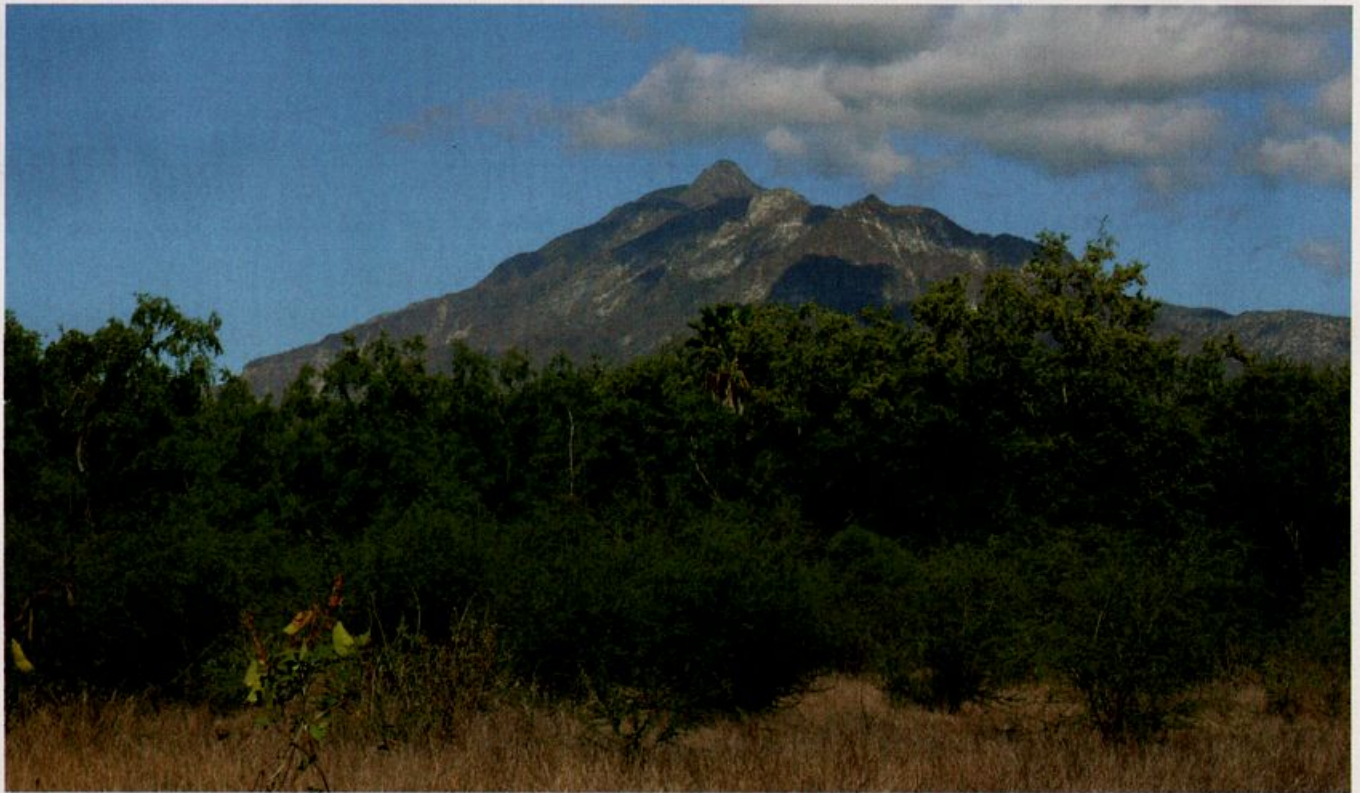
Figure 1. Typical Miraflores thornscrub woodland. This woodland is dominated by legumes in many areas, though some locations have a large live-oak component. Photograph by Steven G. Mlodinow on 25 March 2007.

STEVEN G. MLODINOW • 4819 GARDNER AVENUE • EVERETT, WASHINGTON 98201 • (EMAIL: SGML0D@AOL.COM) KURT RADAMAKER • 16313 E. CRYSTAL POINT DRIVE • FOUNTAIN HILLS, ARIZONA 85268 • (EMAIL: KURTRAD@MEXICOBIRDING.COM)