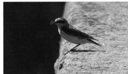
Northern Wheatears at Fort Prince of Wales, Churchill, Manitoba provided the Prairie Provinces Region with its first nesting record, well south of the known range. Here the male is seen carrying food 29 June 2006.

Tantalizing songsters, hinting at breeding in Manitoba, were a Western Tanager in Riding Mountain N.P. 9 Jun (Birdquest, vide CC) and a Spotted Towhee near Miniota 10–11 Jul (LV). Lark Buntings were numerous in parts of s. Saskatchewan, with about 60 in the Tribune area 29 Jul (V&DT) and good numbers w. of Tompkins the same day (SW). Baird's Sparrow numbers in sw. Manitoba remained disturbingly low (KDS, m.ob.). Well out of range were a Northern Cardinal at Lumsden, SK 9 Jun (CP), a territorial Black-headed Grosbeak near Coulter, MB 30 May–Jul (KDS et al., m.ob.), and a Lazuli Bunting at Newdale, MB 11 Jun (SSw, JB). Also noteworthy, an Eastern Meadowlark sang near Blumenort, MB 2 Jun (VR). An American Goldfinch furnished just a 2nd Churchill record 14 Jun (BDL), and an Eurasian Goldfinch visited a feeder near Minnedosa, MB 19 Jun (LBo).