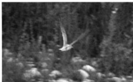
This Least Tern at Calgary, Alberta 4 July 2006 provided the first confirmed record for the province. The Prairie Provinces have just a handful of records of this species.

Five Great Egrets were reported from three Alberta locations in Jul (LBe, SC, MK). It was another bumper year for waders at Whitewater, with peak counts of 11 Great Egrets 10 Jun (WC, MW) and 4 Snowy Egrets 28 Jul (GH), plus an ad. Little Blue Heron 8 Jun (BDL et al., m.ob.). Several Saskatchewan reports of Cattle Egrets included 20+ near Aberdeen 26 Jun (NC, DC), and the Oak Lake, MB colony discovered last year was active again, albeit with reduced numbers (RBz). Eight small Cattle Egret colonies at Whitewater totaled 47 nests, most in association with Black-crowned Night-Herons (RBz). A Yellow-crowned Night-Heron visited Oak Hammock 13-14 Jul (AM). Three White-faced Ibis nests were found at Whitewater (RBz), where the highest ibis count was 16 White-faced and at least one Glossy in late Jul (GH, LV, CA et al.). Other high counts included 14+ White-faced Ibis at Chaplin L., SK 24 Jul (RE) and up to 10 at Lizard L., MB (CC), while one was