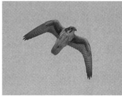
This Prairie Falcon spent most of the winter just north of Winnipeg, Manitoba (here 1 March 2004), where it fed on an abundant supply of Rock Pigeons. Rare in the province at any time of the year, it attracted numerous observers.

Wintering sparrows, other than Dark-eyed Juncos, were relatively scarce, with only one American Tree Sparrow reported in s. Saskatchewan. Unusually far n. were 5 Dark-eyed Juncos at Nelson House, MB 3 Feb (RB). Likewise, heavy snow cover apparently drove Lapland Longspurs s. of the border. Three Northern Cardinals were reported in Saskatchewan, with a male surviving to at