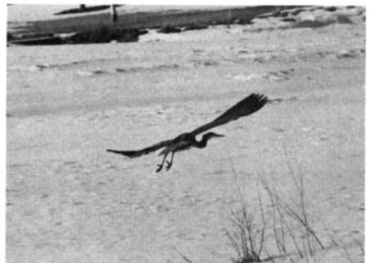
Rare anywhere in the Prairie Provinces in winter, this Great Blue Heron at High River on 10 January 2003 was one of five reported in Alberta during December and January.