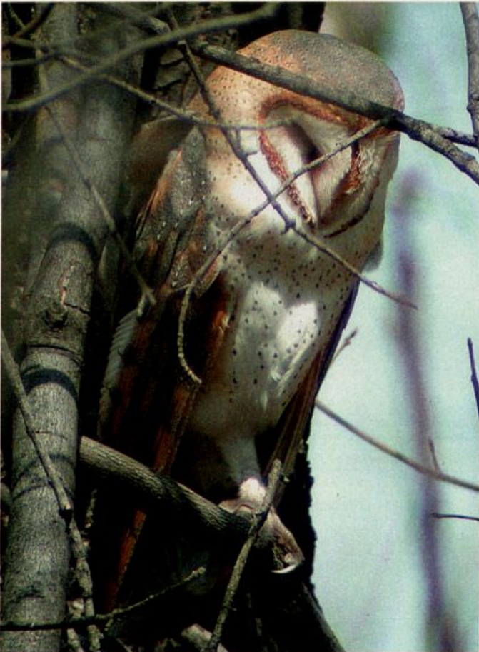
A Barn Owl present for one day 21 April at Île des Soeurs, Québec, attracted much attention. Although there are at least 50 records for Québec, this may be the only the second time this species has been photographed alive in the wild here. Very few birders from Montreal had seen this species in the province before this individual appeared, as most of the records are from farmers or of specimens found dead. The photograph was taken by digiscoping (to learn more, consult: http://www.vdn.ca/~ledy/portfolio1e.html ).