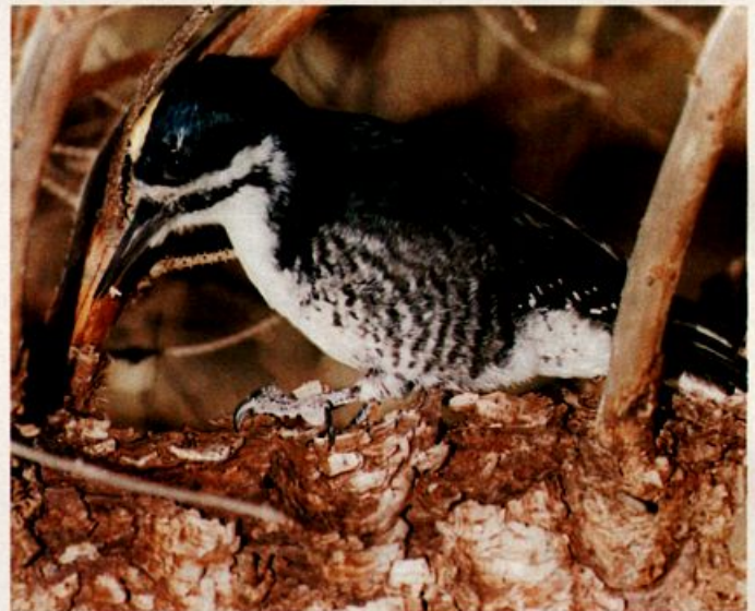
A long-staying male Black-backed Woodpecker delighted many observers at the Pocono Environmental Education Center in Pike County, Pennsylvania from 6 March to 16 May. It provided the second documented state record. This image was taken 29 April 2001.