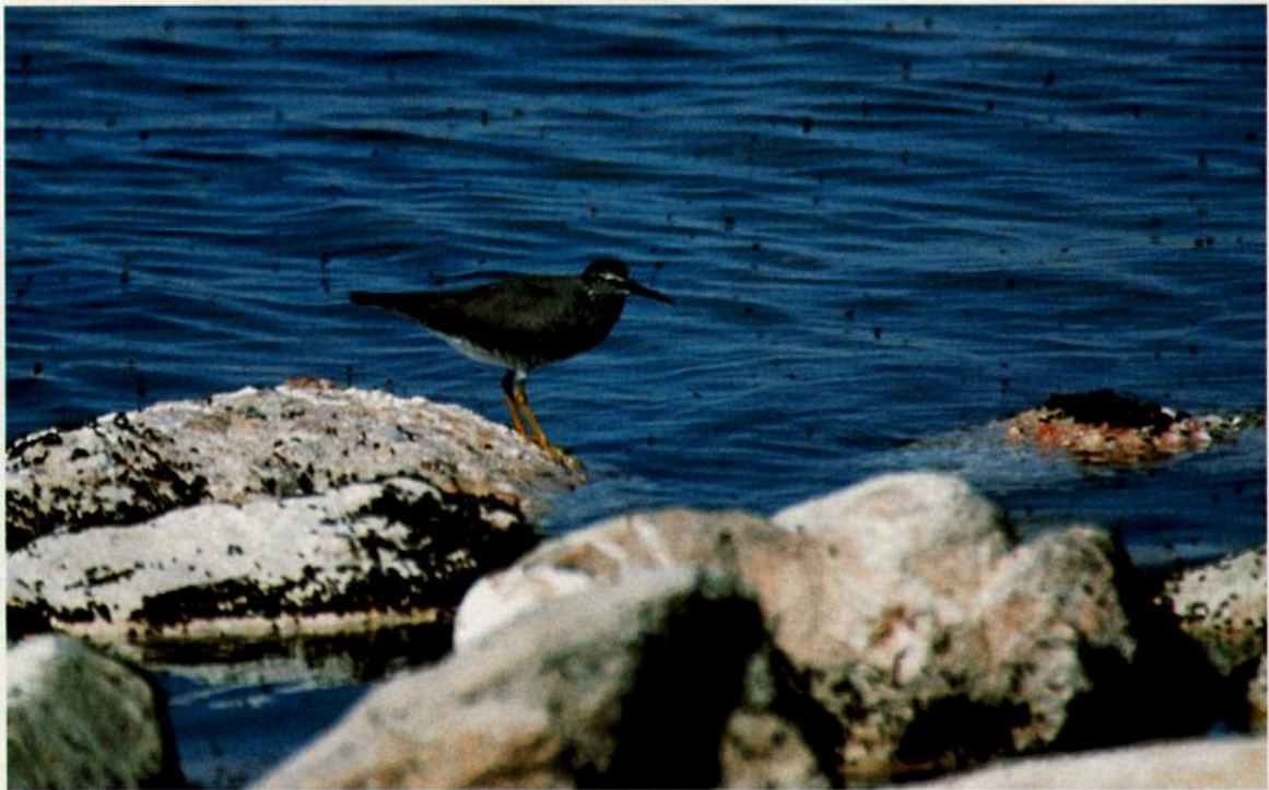
This Wandering Tattler, a species rare anywhere in the continent's interior, was found at the Antelope Island Causeway, Davis County, Utah, on 25 May. It remained into June and allowed extensive study by many observers. This spring was particularly productive for shorebirding in the eastern Great Basin.