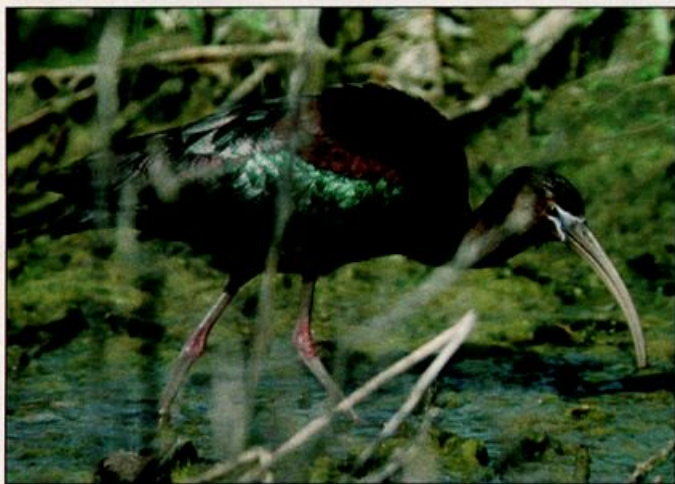
Northern California's first Glossy Ibis was in Alviso, Santa Clara County 14–15 May and in nearby Alameda County 20–21 May. It accompanied a major incursion of White-faced Ibis towards the coast and indeed a major flight of both dark Plegadis out of range in spring 2001. This photograph was taken on 15 May near the TiVo™ parking lot by the intersection of Highway 237 and Gold/Lafayette streets in Alviso.