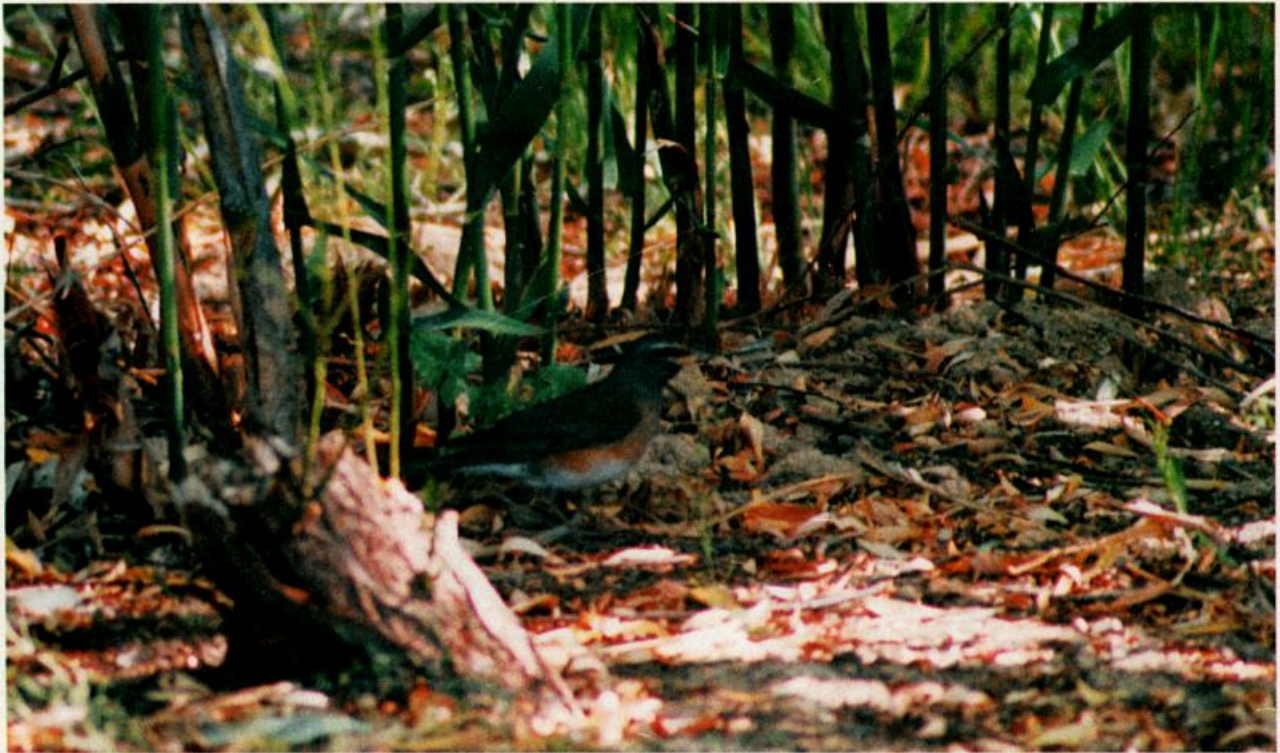
The first Eyebrowed Thrush in North America away from western Alaska shocked visitors to Galileo Hill Park, an oasis in the Mojave Desert of Kern County, in southern California on 28 May.