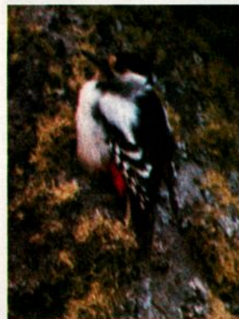
One of two recorded in spring 2001 in Alaska, this Great Spotted Woodpecker was noted 11 May on Shemya Island, Alaska. The other was much farther east on St. George Island five days earlier. These are the seventh and eighth individuals recorded in the state.