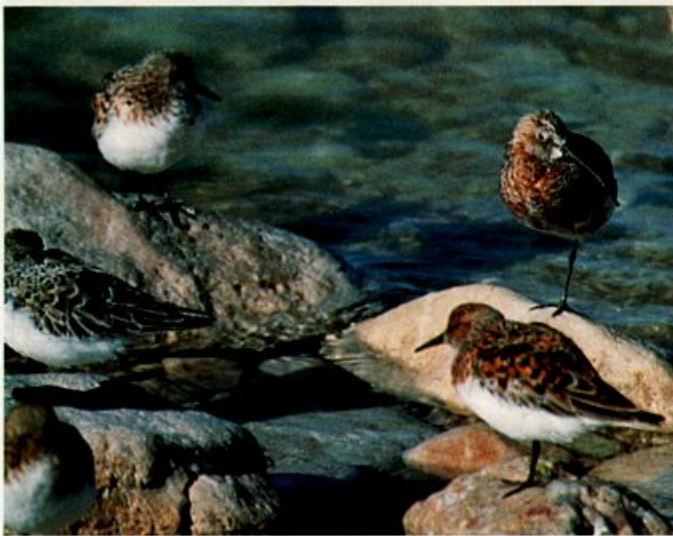
A Curlew Sandpiper at the Antelope Island Causeway, Davis County, Utah 6–8 May was the third state record for the species.