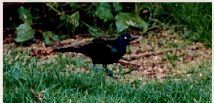
This Common Grackle, a species showing up with greater frequency in western states and provinces, was in Quatsino, north Vancouver Island, British Columbia, 20–24 April. This was the island's third record but first in spring.