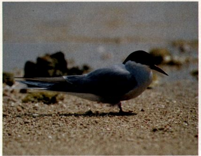
Among a great passage of pelagic seabirds documented throughout the Lesser Antilles, Bahamas, and Bermuda this spring, this Arctic Tern was captured on film 21 May on the beach at Guadeloupe.