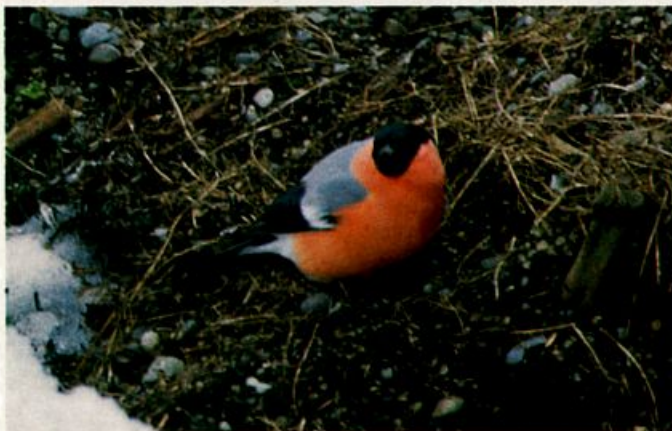
Birders touring Gambell, St. Lawrence Island, Alaska were welcomed from 28 May onward by this handsome male Eurasian Bullfinch that frequented the town's middens.