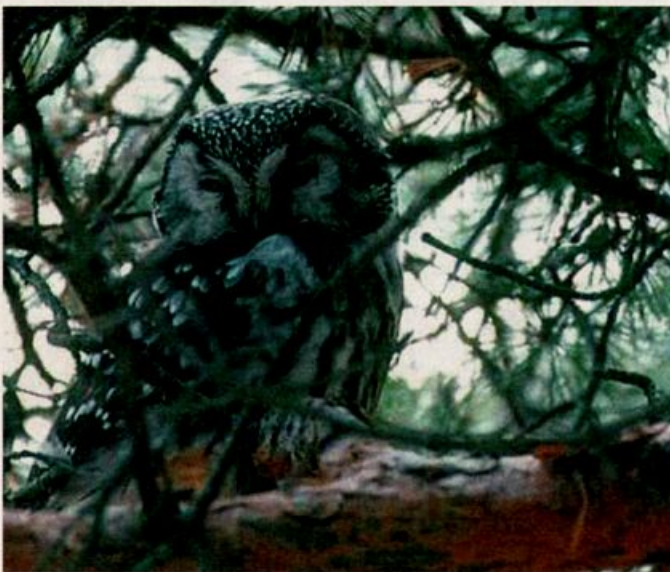
This Boreal Owl, banded at Presque Isle State Park, Erie, 7 April 2001, provided the first Pennsylvania record since 1896, when one was collected near Pittsburgh.