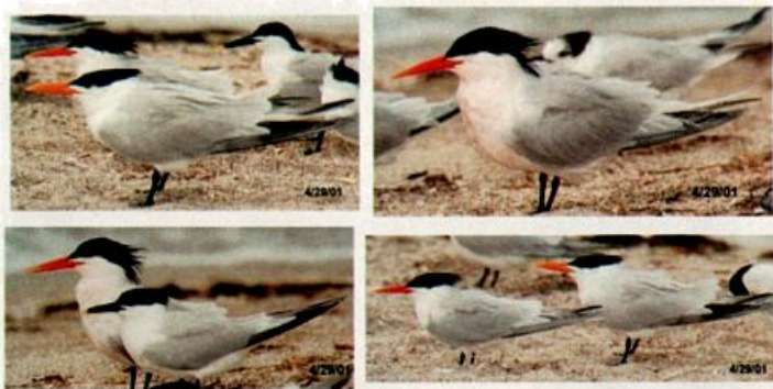
This adult Elegant Tern, thought to be the same individual as noted in December 2000, courted, then copulated with this female Sandwich Tern at Fort De Soto County Park, Florida 26 April 2001; the Elegant Tern had first been refound on 20 April.