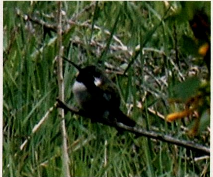
This male Costa's Hummingbird was Colorado's first at Crow Valley Campground, Weld County (photographed 17 May 2001).