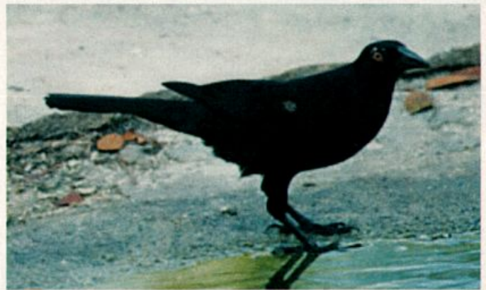
The West Indies' first Giant Cowbird, a female, was documented nicely on Barbados at Palm Beach 6 March 2001.