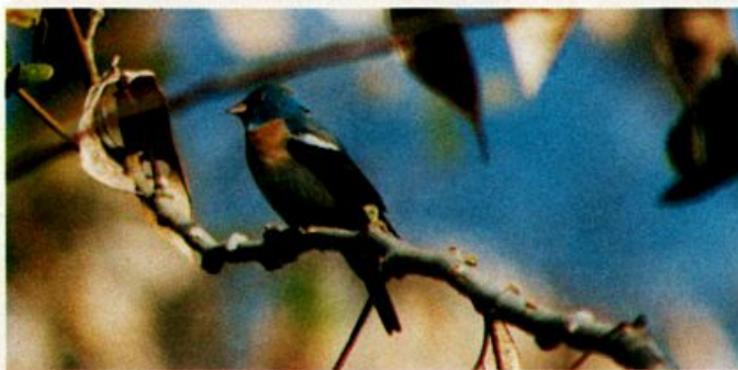
A male Lazuli Bunting, one of two in Florida this spring and a genuine vagrant in the East anywhere, frequented a very productive Mulberry tree at Fort De Soto County Park 18–24 April, the only previous record for Florida comes from 1977.