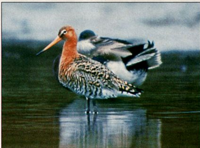
The much-observed Black-tailed Godwit at Eastport, Long Island was New York's first; it was identified to subspecies as Limosa limosa islandica by virtue of its extensive rich chestnut underparts.