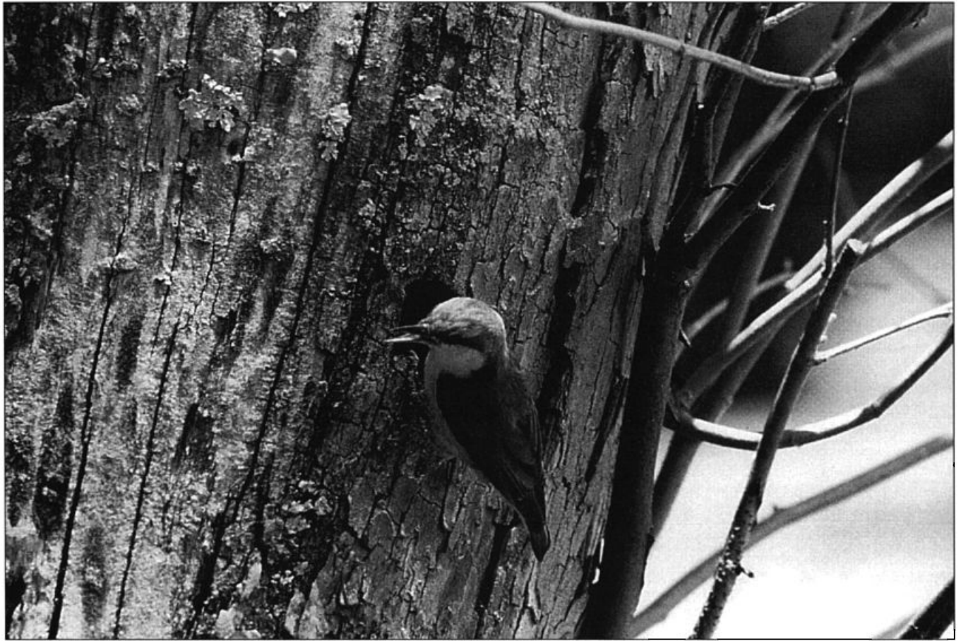
A Brown-headed Nuthatch at its nest hole at Kingston, Roane, Tennessee, 11 May 2000 was at the northern extreme of the species' breeding range in the Appalachian region.

crested Cormorants at Rankin Bottoms, Coke, TN, contained six nests with young 10 Jul (RK); at least 9 summered at Pymatuning L., PA (RFL), and 2 late migrants were at Somerset L., Somerset, PA, 6 Jun (J&RP).