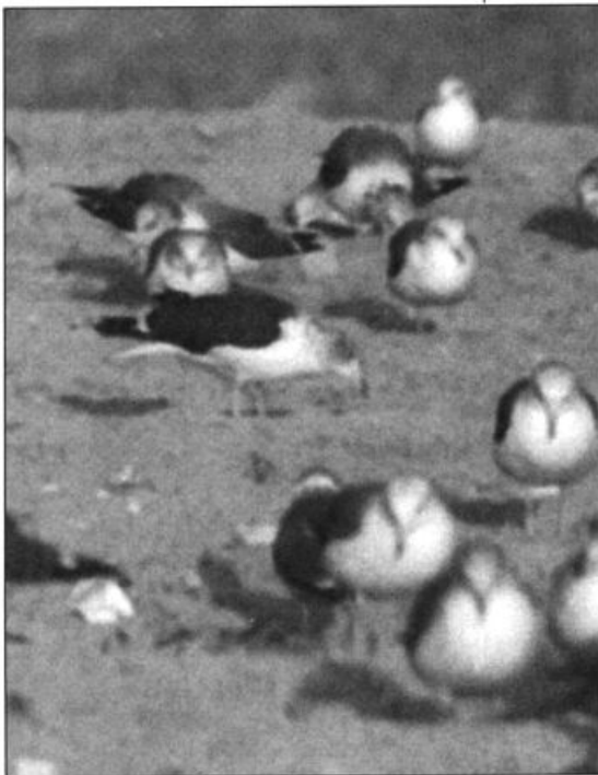
Like the Little Gull, the Lesser Black-backed Gull is being found in larger numbers and spreading westward. Nonetheless, this adult at a landfill near Deer Flat National Wildlife Refuge, Idaho, 11–30 Nov 1999 (where this photo was taken 30 Nov) provided a state and Regional first.

and one was in Boise 19 Nov (DT). Now annual, single Glaucous-winged Gulls appeared at A.F.R. 6–7 Nov (MCR, m.ob.) and Minidoka N.W.R. 11 Nov (MCR, DT). Only Montana hosted Sabine's Gulls in Lincoln 26 Aug (EC) and Beaverhead 1 Oct (DC). A very late Arctic Tern that landed in Missoula, MT, 15 Nov (JM) provided Montana's fifth record.