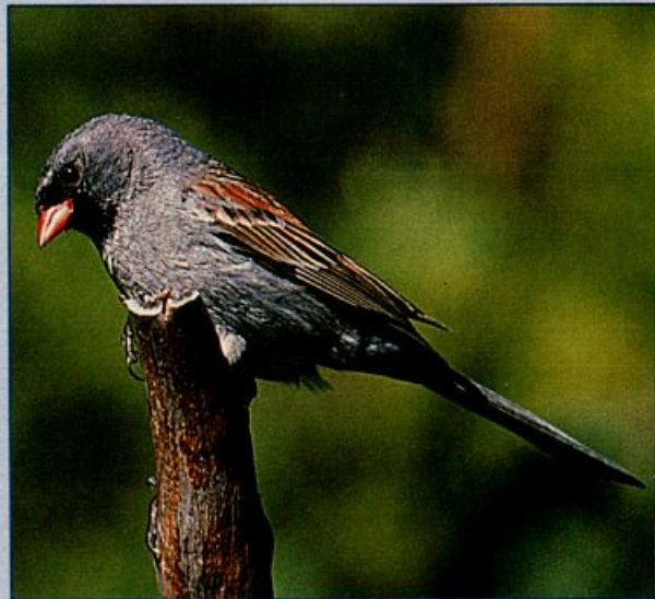
Black-chinned Sparrows, like this one at Foresthill on 31 May 1999, continued their northward push in the Sierra Nevada range, California. (See the Middle Pacific Coast Region for details.)