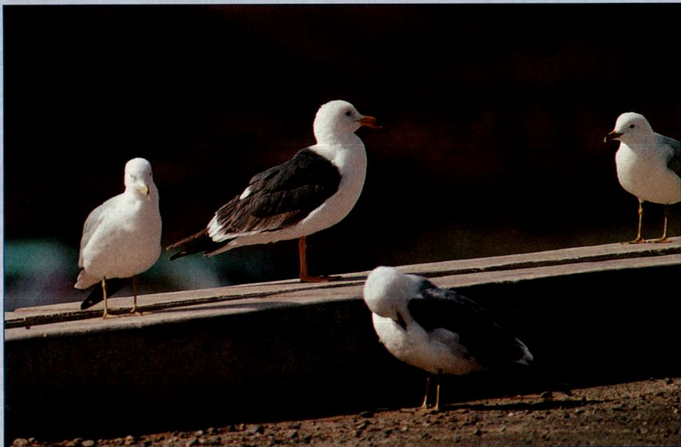
An endemic breeder to the Gulf of California, the Yellow-footed Gull normally occurs in the United States only at the Salton Sea, California. It has wandered to the southern California coast, and north to eastern California and southern Nevada, and northern Utah, and east to Texas, so this second-summer bird at Wahweep on Lake Powell 21–23 April 1999 provided an "overdue" first for both Arizona and Utah, as the bird frequented both sides of the lake. This image of the bird with Ring-billed Gulls is from the final date.