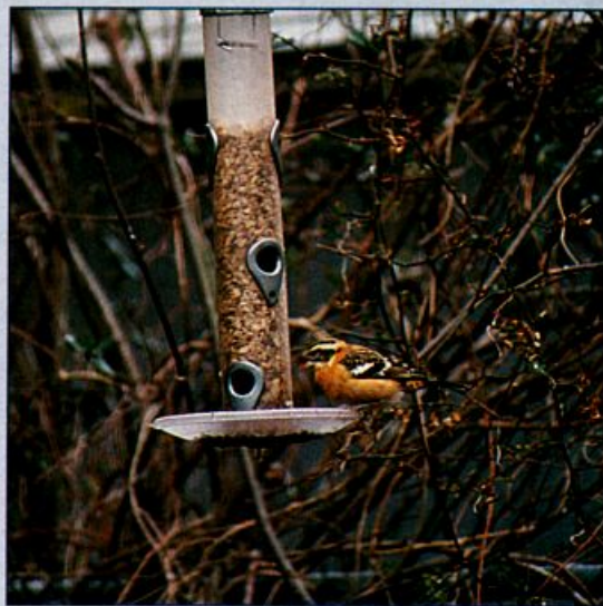
This immature male Black-headed Grosbeak (aged and sexed by the rich orange underparts and black head pattern) wintered at a Goshen, New Jersey, feeder, where it lingered until 6 March 1999 and where this image was captured 9 February 1999. This species is quite scarce on the Atlantic Coast.