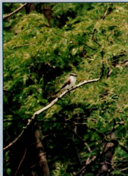
Although well known for wandering far afield, with many records for the Atlantic Coast and north to Michigan and even British Columbia, this Gray Kingbird was nonetheless an exciting State first at Carlyle Lake, Illinois, 15 May 1999, and a Regional first for the Middlewestern Prairie.