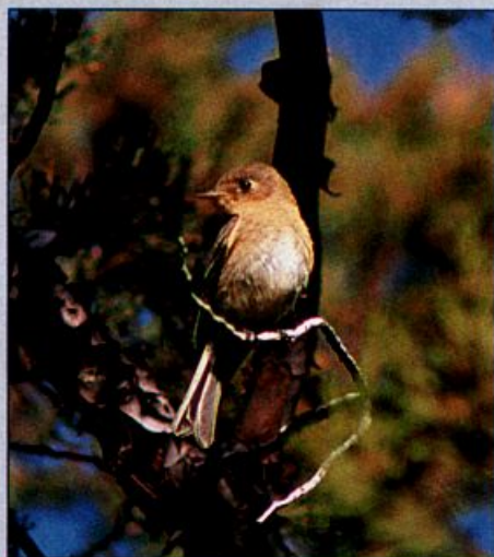
Another first for the burgeoning State List of Texas, this singing male Buff-breasted Flycatcher was at the Davis Mountains Preserve 5 May 1999. Note the rich-buff wash to the throat and breast and the distinct eyering. It was first discovered on 3 May, and shortly thereafter a copulating pair was observed. See the summer report for details about the nesting effort.