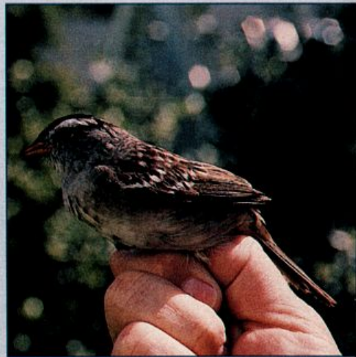
The gambelii subspecies of the White-crowned Sparrow is a bird of the West and is thus rare in the East. This individual, banded as an immature at Chino Farms 5 March 1999 (left), not only provided the first well-documented record for Maryland, but was recaptured 25 April 1999 in adult plumage (right)!