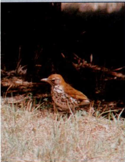
This Wood Thrush near Pep on 26 April 1999 was one of few ever found in New Mexico. This species is extremely scarce throughout in the West, and is likely to remain so as numbers in the East decline.