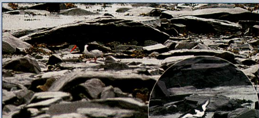
Two images, taken 11 April, of North America's second Eurasian Oystercatcher at Eastport, Newfoundland, 3 April–2 May 1999. The black upperparts and the extensive white on the rump and wings are good distinctions from the American Oystercatcher.