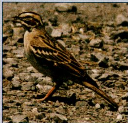
The handsome Lark Sparrow is noteworthy in much of the East. This male was seen at Rock Springs, Pennsylvania, 10 May 1999 into June, the first for the State College area since 1931. This image was taken on 15 May.