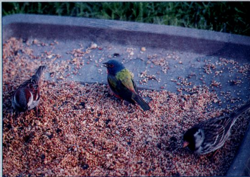
Despite their tendency to appear well outside their normal range, this adult male Painted Bunting was still a surprise at Kennedy, Saskatchewan, 1–13 May 1999, and provided first for the Province and Region. This photo, with a male House Sparrow on the left and an adult Harris's Sparrow on the right, was taken 12 May. Given the bunting's prevalence in captivity, natural occurrence is always a concern in this gaudy species.