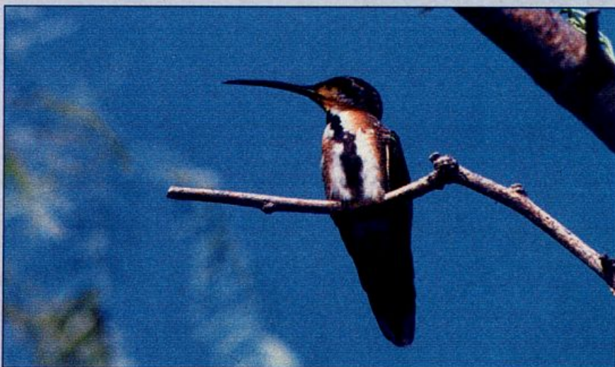
This immature (or female) Green-breasted Mango at Los Fresnos, Texas, 22-23 May 1999 provided the 7th record for Texas and the United States, a remarkable total given that the first was only a decade ago. The photo was taken on 23 May.