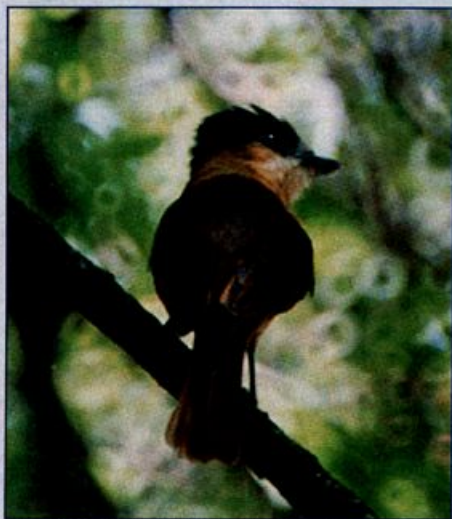
This female Rose-throated Becard at Anzalduas Park 24 April 1999 was part of a pair that stayed through the summer beginning that date. Their nesting effort was the first in Texas in over 20 years.