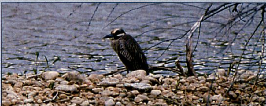
The Yellow-crowned Night-Heron is rare anywhere in the West, so this adult was a nice find at Boulder, Colorado, 22 May 1999.