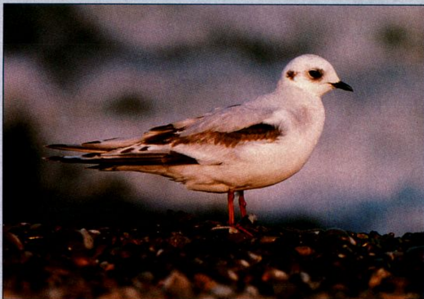
The Ross's Gull was long predicted to occur at Point Pelee, Ontario, one of the most popular birding Meccas in all of North America. Yet who would have predicted that when their first finally came of this delicate Arctic waif that it would be in spring? This bird, still in fresh first-winter plumage, was enjoyed by hundreds of observers 17-18 May 1999, with this photograph taken the first date.