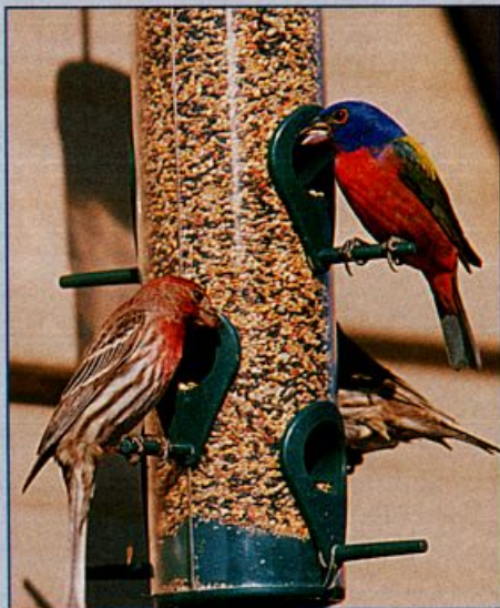
This adult male Painted Bunting, with House Finches photographed on 30 April, was far less adventurous than the bird that strayed to Saskatchewan, but was nevertheless well north of its usual range, near Aztec, New Mexico, 28 April–2 May 1999.