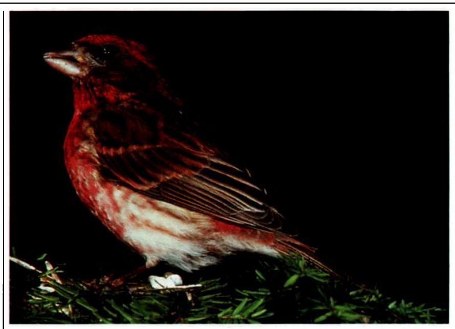
The bird that started Ridgway on his path to fame, the Purple Finch ( Carpodacus Purpureus).

In early July there came an answer, not from the Patent Office, but from Spencer F. Baird, Assistant Secretary of the Smithsonian Institution. Baird praised Robert's artistic ability and his attention to scientific detail. "I had no difficulty in recognizing the bird you sent, and was much pleased to see that you had given all the essential features of form and color with much accuracy. The bird is the Purple Finch (Carpodacus purpureus)." Baird urged Robert to continue his studies of birds, and asked what eggs