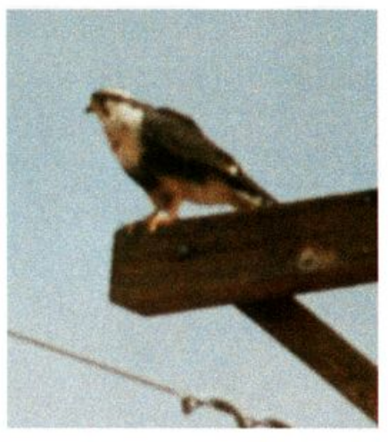
It had been many years since any record of Aplomado Falcon in the southwestern United States had been well documented. This bird photographed June 25, 1991, at White Sands Missile Range, New Mexico, was unquestionably an Aplomado—but the Regional Editors had some questions about its origins.