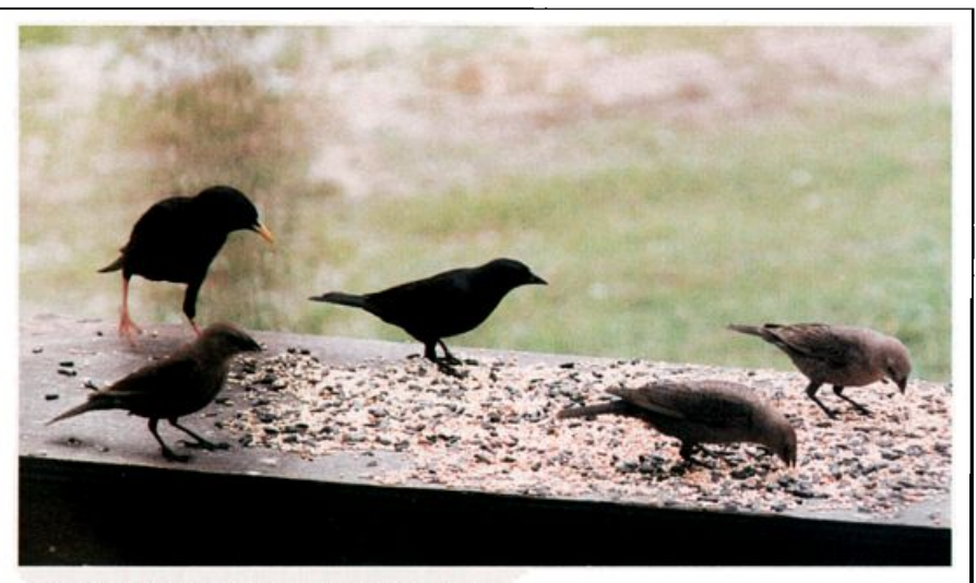
Providing a first state record was this male Shiny Cowbird (back center) associating with three female cowbirds (apparently Brown-headed) and one male European Starling at Waveland, Mississippi, June 12, 1991.