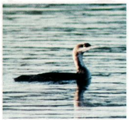
Pacific Loon in first-summer plumage on Sun Lake, Lake County, Illinois, June 24, 1991. An exceptional summer record for the Midwest.