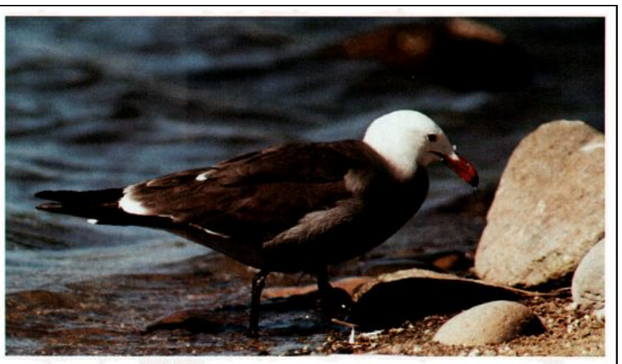
This adult Heermann's Gull turned up far from its usual coastal haunts at Paradise Pond, Reno, Nevada, on June 3, 1991.