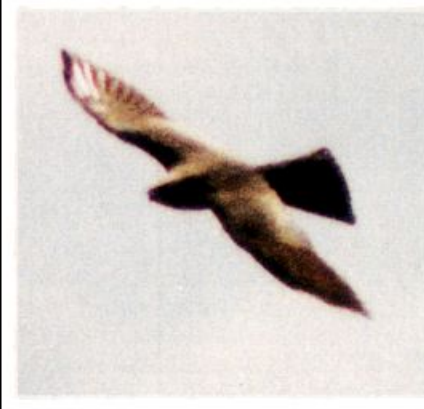
Adult Mississippi Kite in Greensville County, Virginia, near the North Carolina border, June 6, 1991. One of two adults present at this site.