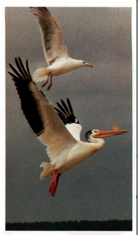
This wandering American White Pelican was seen on most of Virginia's coastal islands during this summer. It was photographed June 18, 1991, at a sandbar between Cedar and Metompkin islands, Virginia.