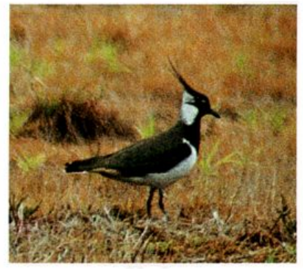
"The most obliging lapwing in recent history" was this male Northern Lapwing that spent the whole summer of 1991 near Aulac, New Brunswick. Most North American appearances of this Eurasian plover have been very brief.