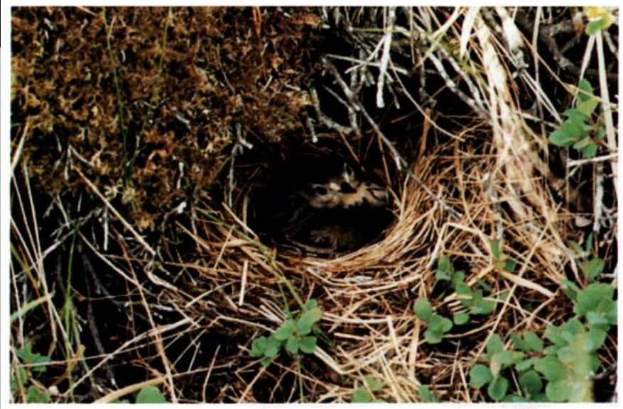
American Pipit incubating eggs in a nest on Mount Washington, New Hampshire, June 29, 1991. A new nesting location for the species, and the southernmost known in eastern North America.

Female Hooded Merganser (back) with a group of her young at Des Plaines Conservation Area, Will County, Illinois, June 15, 1991. The species is a rare breeder in this area.