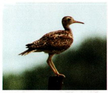
Upland Sandpiper on territory at the Joliet Arsenal, Will County, Illinois, on June 21, 1991. Such places can provide essential habitat for beleagured wildlife; the Arsenal hosts the largest population of Upland Sandpipers in Illinois.