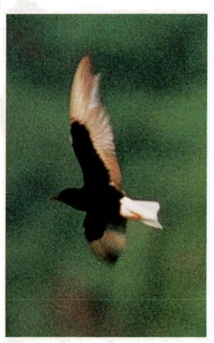
Adult White-winged Tern near Greece, New York, June 19, 1991. First fully documented state record, only a month after the first sight record (at the other end of the state, on Long Island). As this portrait shows, the species is "whitewinged" only from the upperside.