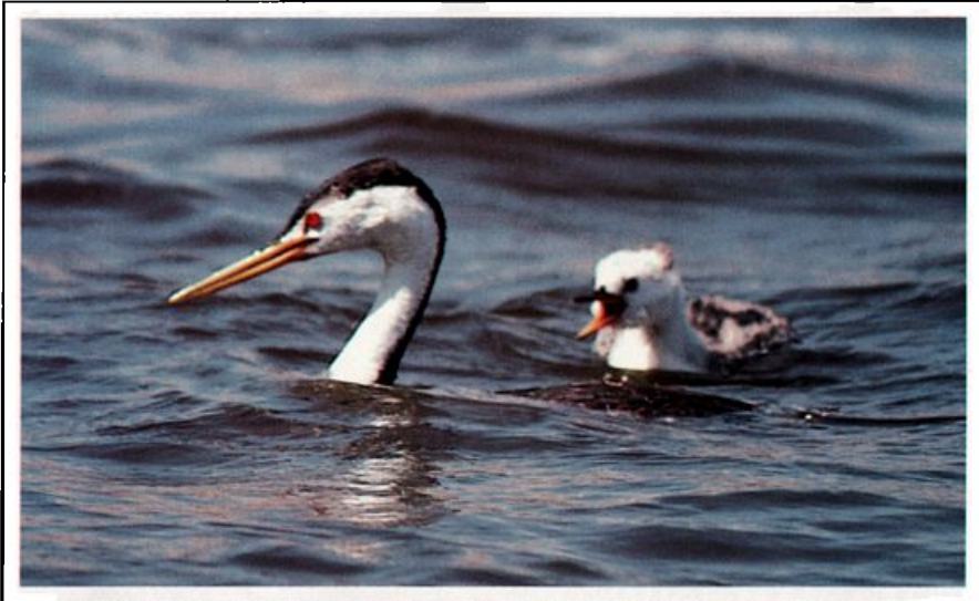
Adult Clark's Grebe with downy young at Lake Traverse, on the Minnesota/South Dakota border, summer 1991. First nesting record for Minnesota.