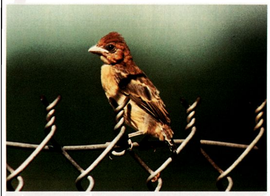
Blue Grosbeaks are continuing to expand at the northern edges of their range. This recently fledged juvenile was found in western Will County, Illinois, on August 13, 1991.