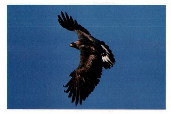
Fig. 5. Immature or subadult Golden Eagle. Note white at base of tail

tail. In some cases, a more or less complete terminal tail band is present. Subsequent adult plumages are alike, however even older adults can show brown and black spotting in the white of the tail.