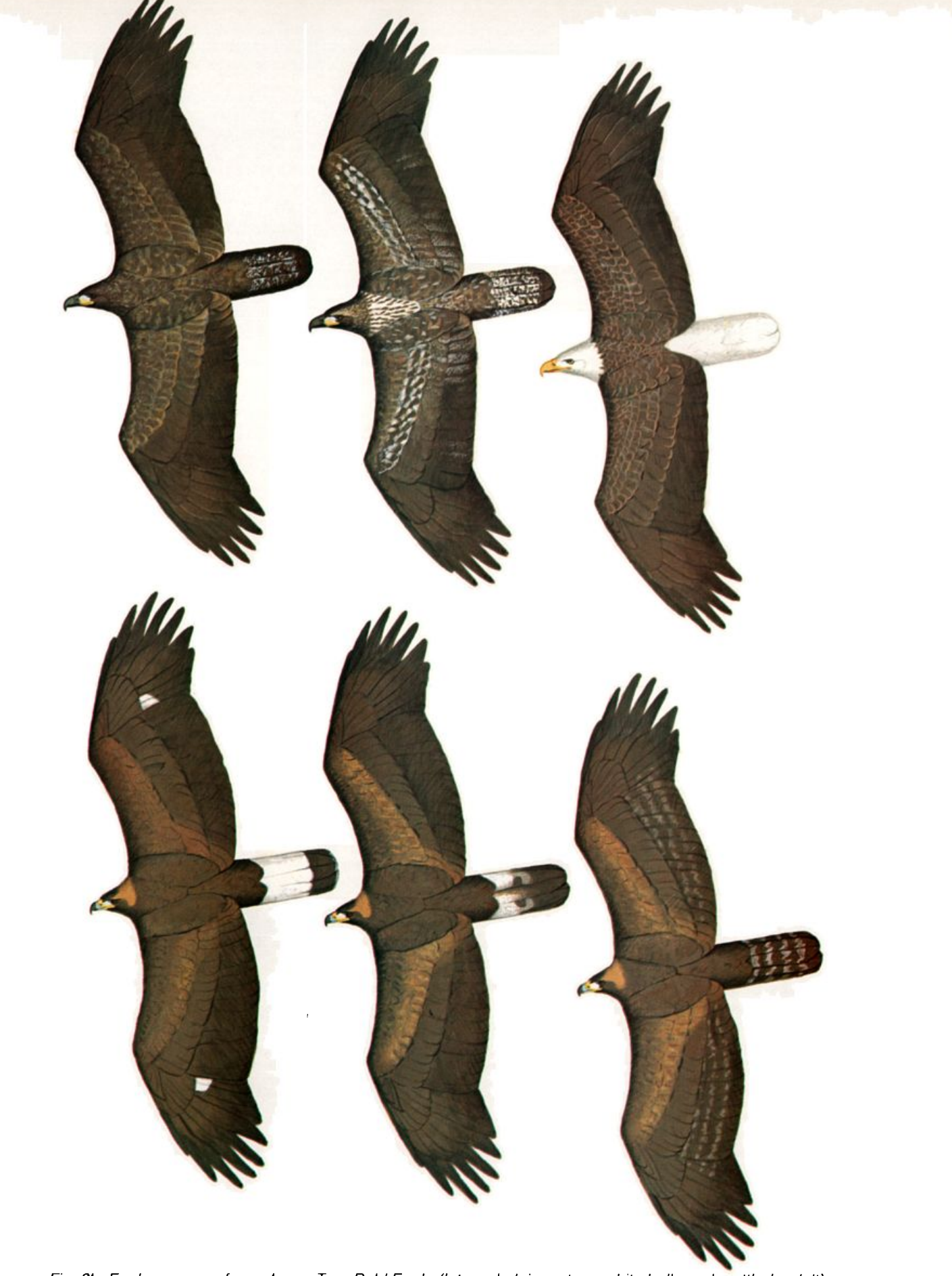
Fig. 3b. Eagles as seen from above. Top, Bald Eagle (I. to r. dark immature, white belly and mottled, adult), below, Golden Eagle (I. to r. immature, sub-adult, adult).