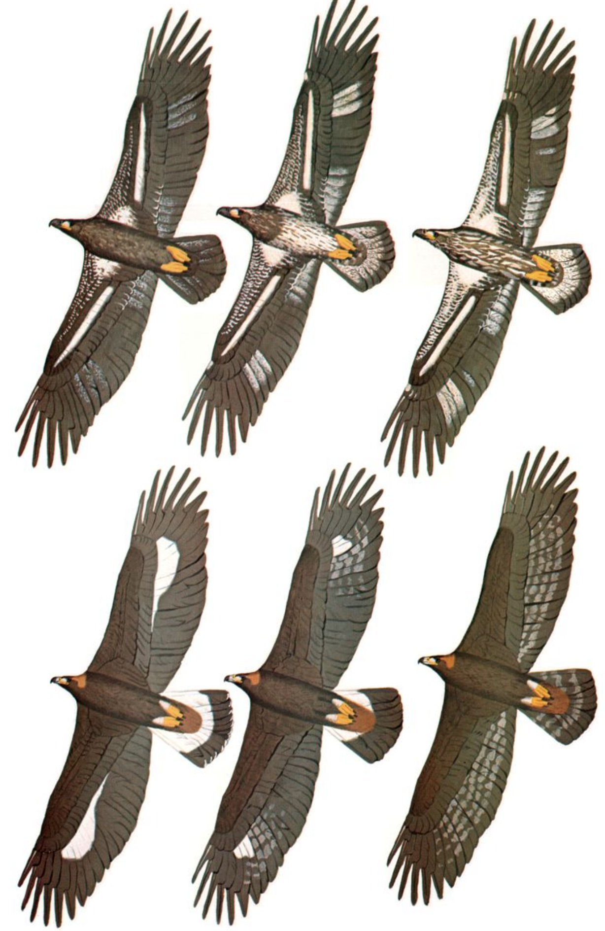
Fig. 3a. Eagles as seen from below. Top, Bald Eagle (I. to r. dark immature, white belly, mottled), below, Golden Eagle (I. to r. immature, sub-adult, adult).