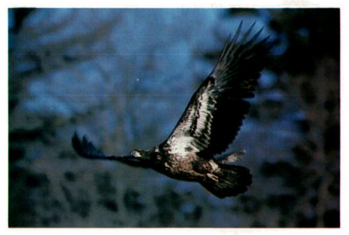
Fig. 4. Immature or subadult Bald Eagle. Note white underwing and "wingpit."