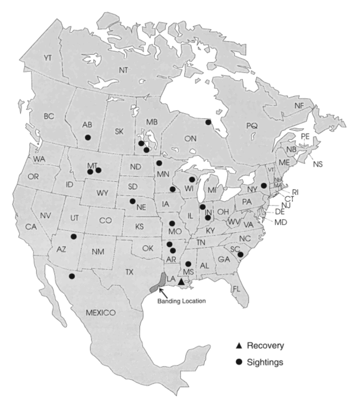
Figure 2. Location of out-of-state sightings and recoveries of bald eagles banded and color-marked as nestlings in Texas, 1985-93.