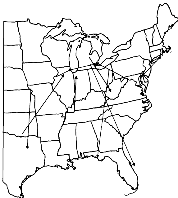
FIGURE 2. Long-distant, spring recoveries of the House Wren.

in the 49–60-month category. There were 2 wrens each in the 61–72- and 73–78-month categories.