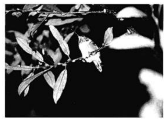
FIGURE 1. Torpid immature male Rufous Hummingbird. This individual's body mass was 60% above lean body weight just before he roosted and entered torpor. He resumed migration at dawn the next day.

in the cold dry winter than in the warmer wet summer when more flowers and insects were available (Carpenter 1974). However, the energy state of the birds in these two studies was unknown.