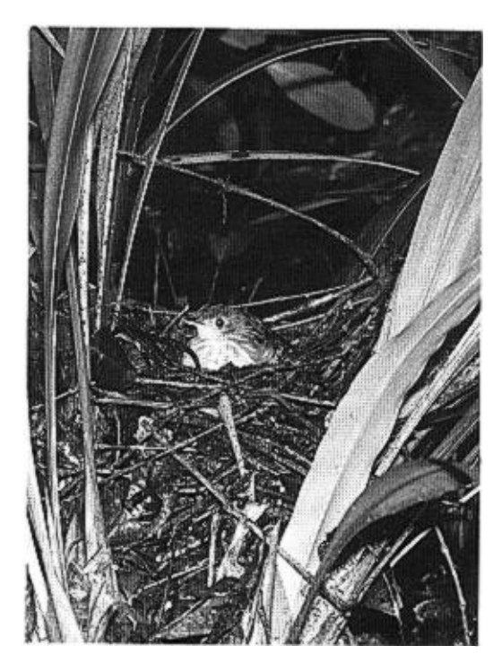
FIGURE 3. Nest and a brooder of the Thrush-like Antpitta.