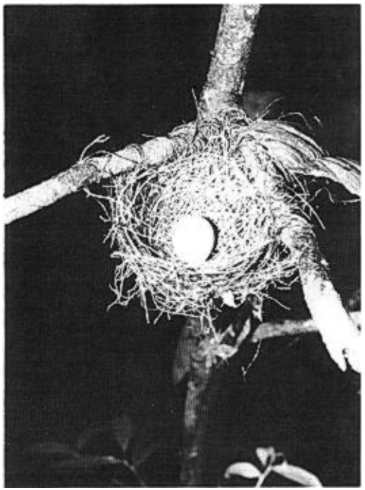
FIGURE 2. Overview of nest and the single egg of the Wing-banded Antbird.

These 10 records clearly indicate that the nesting of the Wing-banded Antbird takes place during the main dry season of July to October. But the three of them reported in March to May give some evidence of the nesting during the short and more random dry season which may be interrupted by the long rainy season at the beginning of the year. We believe that only a part of the Wing-banded Antbird population is involved in