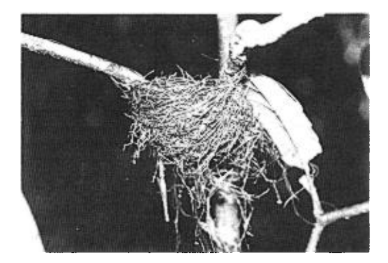
FIGURE 1. A lateral view of the nest of the Wingbanded Antbird ( Myrmornis torquata ), 28 July 1985, Southern French Guiana (O. Tostain).

a chocolate-brown down, grayer on belly and flanks. The mantle feathers showed a large pale beige middle track giving a strong mottled appearance at a distance in the field. The tail feathers had only grown to 3-mm quills and the wing feathers (primaries and secondaries) were only two-thirds developed. The wing coverts showed the two wing bars of the adult, the bill was blackish with prominent pale mouth corners, the eyes were dark brown, and the legs were gray-blue with five blackish half-rings on the anterior side.