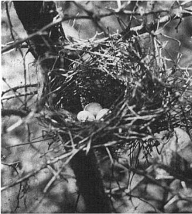
Fig. 1. Nest and eggs of the Rufous-tailed Sparrow ( Aimophila ruficauda acuminata ). Photograph taken in early August, 1950, at Coalcomán, Michoacán, México.

I know of only two other descriptions of the nest and eggs of A. ruficauda . Miller (1932:17) found a nest of the nominate race at Sonsonate, El Salvador, on July 19, 1925. It was in "a crotch five feet from the ground in dense bushes six feet high near the stream and also near a small grassy meadow" and was "composed chiefly of sticks and hair and was deeply cupped and neatly built." The clutch consisted of three pale blue, immaculate eggs. Except for the nest's being neatly built, Miller's description corresponds rather closely with the nest of A. r. acuminata found in Michoacán. Zimmerman and Harry (1951:313) mention two nests of A. r. acuminata found July 27, 1949, at Autlán, Jalisco. These were about five feet up in low acacias and were lined with horse hair.