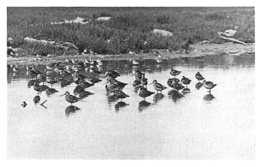
Fig. 20. HIGH TIDE: LONG-BILLED DOWITCHERS AT REST

Nor is it in the realm of nature alone that our artist shows a keen interest and a retentive memory. Art, music, literature, are alike familiar grounds, and one wonders where a single gentleman very much devoted to sport out of doors, ever found time for all these things.