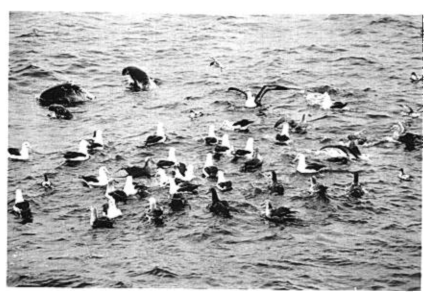
Fig. 2. Flock involving Antarctic fur seals, Black-browed Albatross, giant-petrels, Cape Petrels and a Grayheaded Albatross. To the upper right is a Black-browed Albatross with its wings open, the posture often seen before a dive. Also on the right a Black-browed Albatross is chasing a giant-petrel. The spatial arrangement evident here is typical, with the fur seals at the front, followed by the Black-browed Albatross, and with the giant-petrels at the rear. Note also the "gawky look" or puffed cheeks on the Black-browed Albatross.

frenzies were seen clearly, which enabled us to document fully the birds' behavior. These frenzies varied in duration ( 10\text{--}176 \text{ s}; \bar{x} \pm \text{SD} = 43.8 \pm 55.3 ). The most common bird to arrive first at a new feeding site was the Black-browed Albatross (73.6% of 224 birds total). Giant-petrels (22.9%) and Gray-headed Albatross (3.6%) were the other active species. Of 148 observations of feeding attempts, 83.8% were by Black-browed Albatross, 8.8% by giant-petrels, and 7.4% by Gray-headed Albatross.