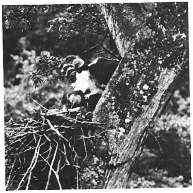
Fig. 1. Eagles copulating on the nest (1-17 June).

observations to a mountain clearing 0.4 km north of the nest until 18 May. During 8 h we did not observe any activity from this point. On 18 May we visited the nest site again. At 1250 an eagle alighted on the nest and began to utter various croaking and chirp-like calls and to arrange nest material. As it adjusted the material, it would commonly correct its balance by wing flashing. This eagle was later confirmed by its smaller size and vocalizations to be the male. Within an hour he visited the eyrie five times bringing sticks. On one additional occasion, he flew from the nest to a limb nearby with what appeared to be the leg of a monkey. Both the male and the female landed on the nest at 1350. Soon after their arrival they rubbed their mandibles together for about 4 s, and while chirping softly began to adjust nest material.