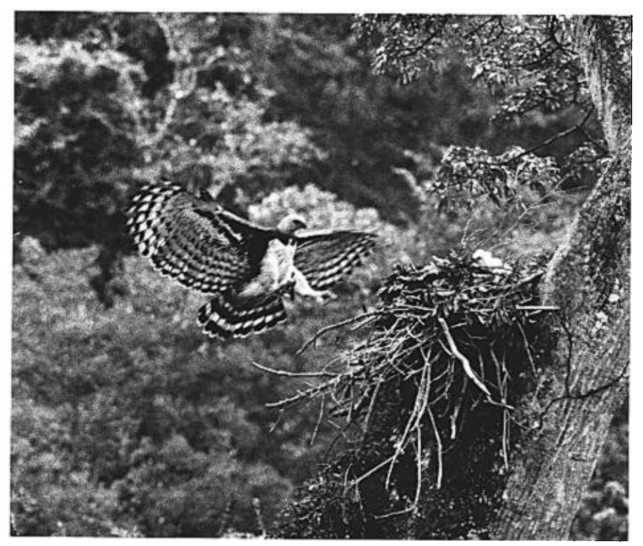
Fig. 2. Female Harpy arriving at nest with green sprig. Young is 38 days old. Upper half of the nest is composed of fresh and dried sprigs.

not seen again that day. The female left the nest at 0808 and perched on a limb of the silk-cotton tree until 1350 when she returned to the nest for 10 min and then departed for the remainder of the day.