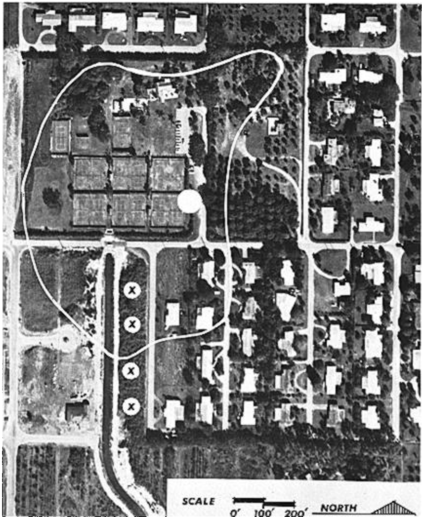
Fig. 5. An aerial view of the territory (outlined) in which a nesting pair of bulbuls was active. Location of the nest is indicated by a circle. The Xs shows the Napier grass of roost No. 2. Directly across the street (east) of the nest is a large strangler fig from which the nesting bulbuls and many other birds fed. A mango grove lies east of the strangler fig. West of the nest are tennis courts.

breeding assemblages they are conspicuous in August and September, and become constantly less noticeable thereafter.