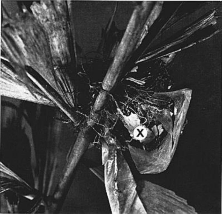
Fig. 4. A Red-whiskered Bulbul nest built in a fish-tail palm ( Caryotis mitis ), a plant exotic to Florida. Note the many oddments woven into it. The X marks a strip of cajuput bark. A long strip of plastic covers much of this view of the nest.

and/or preens or billwipes vigorously. One bird being displayed to feed the other. We noted that a bird that had watched a vigorous display always flew eventually, the other following closely. We never witnessed copulation. These described activities were commonplace in the population from March through June, the principal breeding season.