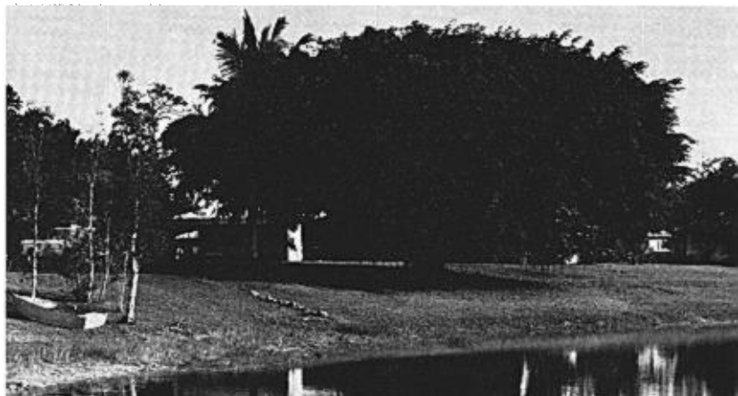
Fig. 3. The large Ficus benjamina of roost No. 3. This tree was first used as a roost in 1967 and was so used through the winter of 1969-70.

more than 50%—which seems excessive. An initial population of more than 10 pairs seems too large from accounts of residents. With an annual increment of slightly more than 40%, five pairs would have increased to a fall population of about 38 birds in 1964 and close to 220 in 1969. Ten pairs, with an annual increment of 33%, would yield a theoretical fall population of 59 in 1964 and about 260 in 1969. Thus, from tentative data, we hypothesize that between 5 and 10 breeding pairs founded the population and that this population increased during the years 1961-69 at an average annual rate of about 33 to 40%. Such a rate falls within the category of successful introduction that Phillips (1928: 3) described as a response to the environment "little short of marvelous."