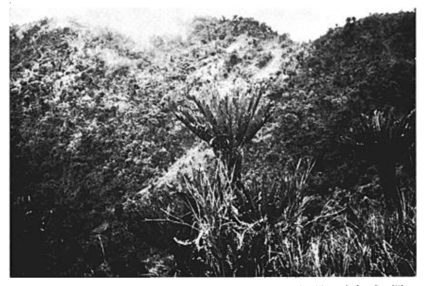
Figure 3. View of terrain and vegetation along the summit ridge of the Cordillera Vilcabamba, Peru. Aerial displays passed back and forth over these ridges and steep slopes. Note mosaic character of the vegetation and tree ferns in the foreground (genus Blechnum ).

become progressively cloudier and darker and rains or sleet storms are of frequent occurrence in the afternoons.