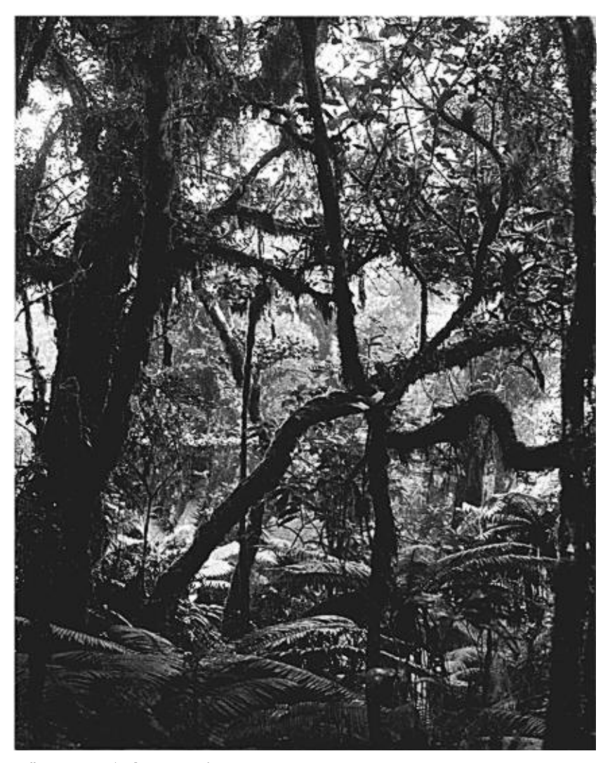
Figure 1. The Elfin Woodland, Pico del Este. This is typical of the Elfin Woodland on the higher peaks in Luquillo Forest. The treefern, Cyathea pubescens , is restricted to this forest type.

resident species of Jamaica. By March 1971, when Parkes visited the forest, the Keplers had concluded that the mysterious warbler must represent a species unknown to science, and invited Parkes to contribute to the primarily taxonomic aspects of its study. Serious attempts to collect a specimen began at that time. On 18 May 1971 Kepler procured a specimen on the high slopes of El Yunque Peak; it indeed proved to be