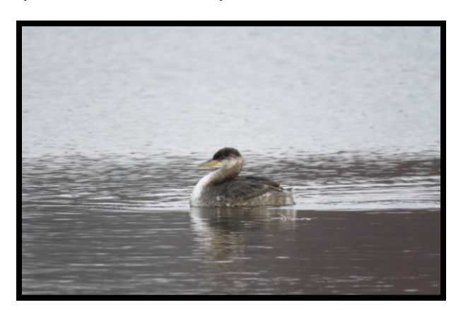
Red-necked Grebe at Whitewater Memorial (Union) on 24 November 2019.