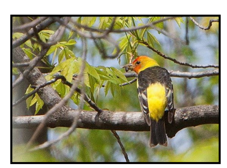
Western Tanager

5. Year lists that contain more than 300 species should be submitted to the IAS Listing Committee. These lists will only be vetted for errors regarding #2 and #3 above.