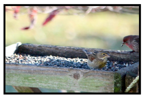
Feeder Dickcissel in Perry County.