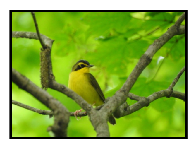
Kentucky Warbler on 11 May 2019 in Vanderburgh Co.

Once again, Red-winged Blackbirds were the most numerous species found with 8,609 reported, followed by American Robin, European Starling, and Canada Goose. Top honors for the most numerous Neotropical migrants went to Tree Swallow with 3,306 followed by Barn Swallow (2,943).