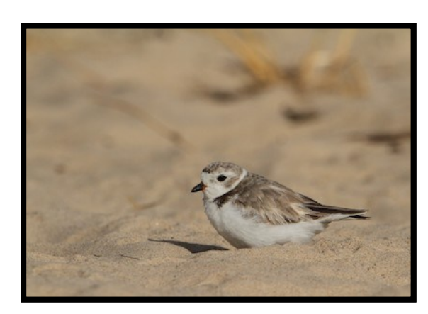
Piping Plover on 10 August 2019, Miller Beach (Lake Co.).