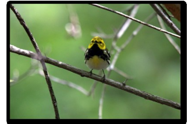
Black-throated Green Warblery in Boone County, 11 May 2019.