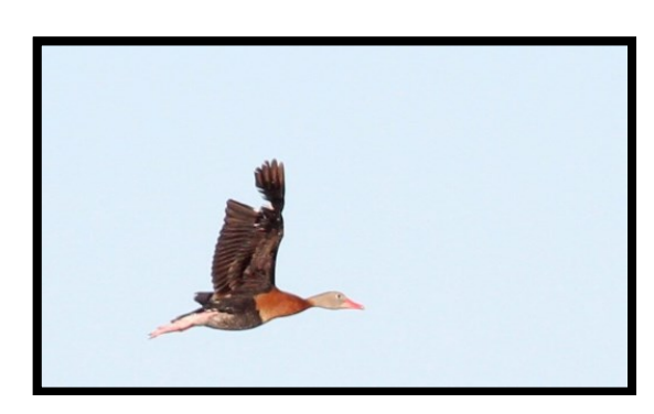
Black-bellied Whistling-Duck at Eagle Marsh Nature Preserve in Allen Co.