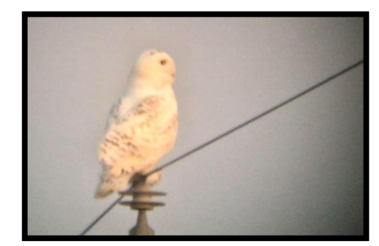
Season's first Snowy Owl at Reynold's Creek GHA in Porter County.