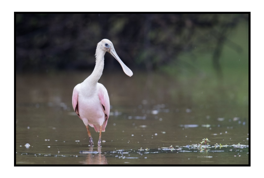
2<sup>nd</sup> state record Roseate Spoonbill in Monroe County. Photo by Ryan Sanderson on 10 June 2019.