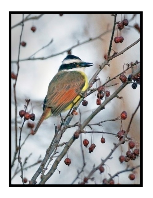
First state record Great Kiskadee in Noble County.

The IBRC bylaws state that members should be in three classes that are approximately equal. Due to the appointment of two single-year Chairs in a row and those incoming Chairs being at end-points in their committee tenure, the committee now has a class of three, a class of four, and a class of zero. Two members of the current class of four voluntarily agreed to resign with the intention of allowing the classes to return to normal. This selfless act restores the committee organization into compliance with the bylaws and makes the committee selection procedure much easier for future committees. The committee is grateful to the individuals who helped make this possible. A bylaw clarification in Section 4.2 NUMBER AND TERM OF MEMBERS to dictate that the class slots remain static if an incoming Chair is chosen from an existing committee member. The new language, which was unanimously approved, is as follows, with the additional portion in italics: