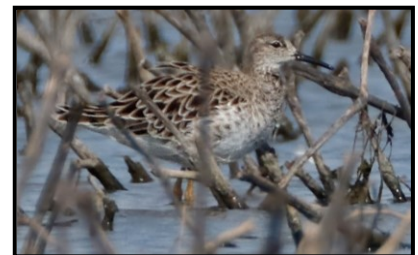
Ruff at Goose Pond, FWA (Greene Co.) on April 14.