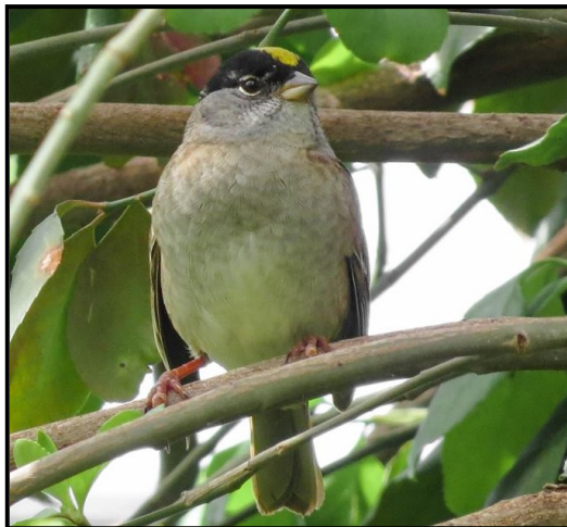
First state record Golden-crowned Sparrow in Indianapolis, Marion Co.