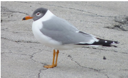
Fig. 2. The “Colonel” in breeding plumage at the Kentucky Fried Chicken parking lot (Chicago) on 25 March 2010. The mantle tint is intermediate between Laughing and Ring-billed Gulls and the hood is gray rather than black.

Upon closer study, however, a number of features were not right for Franklin’s. For one thing the mantle, which was only a half-shade darker than nearby “Ringers,” was too light. Also the white band that separates the black primaries from the gray upperwing on adult Franklin’s was absent (Fig.1). the dark patch behind the eye was also much paler than one would expect for Larus pipixcan . A quick discussion led to the conclusion that the bird must be a hybrid, perhaps a Franklin’s X Ring-billed Gull. As none of the half-dozen birders present had ever heard of that particular hybrid combination, everyone present with a camera focused (no pun intended) on obtaining documentation photos.