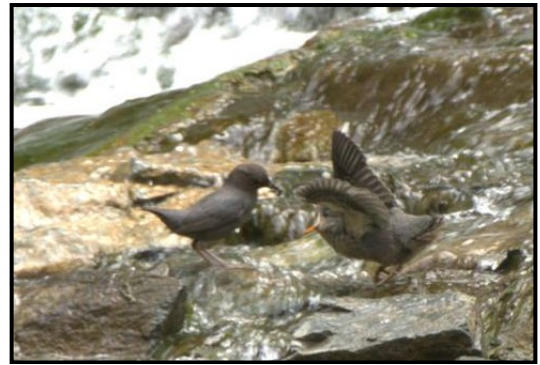
American Dipper feeding young in Spearfish Canyon.

greeted the group. The star of the show appeared a few times, scrambling up the waterfall walls, and making brief flybys. Afterwards, a short drive 3 miles downstream to Bridal Veil Falls wowed everyone. Here, two adult dippers were watched feeding two babies that had recently fledged. They would bob and beg for food whenever the parents came by. Back upstream, Red-naped Sapsucker, more redstarts, and a Red-eyed Vireo finished the Spearfish list. The group ate lunch in the canyon before leaving and added one last bird overhead... Peregrine Falcon.