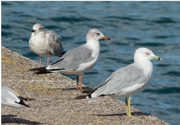
Fig. 6. A 21 August 2016 photo of the “Colonel” in winter plumage. A flight shot taken at this time revealed that the bird was still molting its primaries. Amar Ayyash took the picture at Calumet Park, IL.