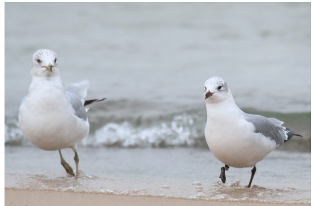
Fig. 7. The Michigan City hybrid (right) with a Ring-billed Gull showing the smaller size of the hybrid.