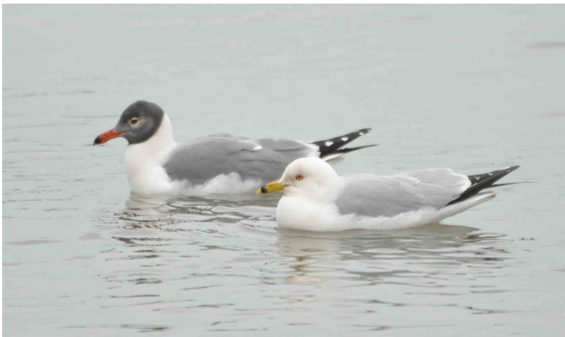
Fig. 4. The "Colonel" and its mate at Calumet Park, IL on 14 April 2012 (Amar 2012). Compare the bird's size and mantle tint with the Ring-billed Gull. Interestingly, the pair was observed copulating, revealing that the Colonel was in fact a female—oops.

The first local report of a hybrid occurred at the KFC lot in spring 2001 and was documented by Walter Marsicz and Tadas Birutis (Amar Ayyash personal comm.). According to Amar this individual was in first-cycle plumage. The identification of this hybrid's parents was strengthened when the USDA Wildlife Service photographed an adult Laughing Gull on a nest in a Ring-billed colony at Lake Calumet in June 2007. This site is about four miles west of the Indiana state line. The nest contained one egg and constituted Illinois's first breeding record for the Laughing Gull ( Meadowlark , A Journal of Illinois Birds, Volume 17, Number 1- fide Walter Marcisz). However, reports of hybrids prior to 2007 clearly indicates that nesting also occurred earlier.