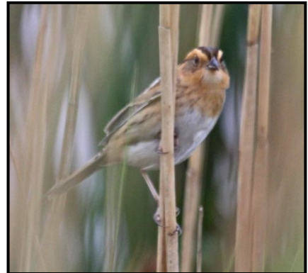
Nelson's Sparrow at Willow Slough FWA, Newton Co. on May 20.