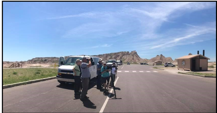
Roadside birding in Badlands National Park.