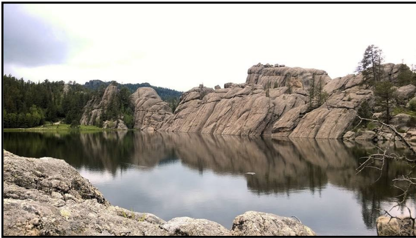
Sylvan Lake scenery in Custer State Park.

fascinating assortment of birds. It is hoped that a return to the Black Hills can be offered sometime in the future.