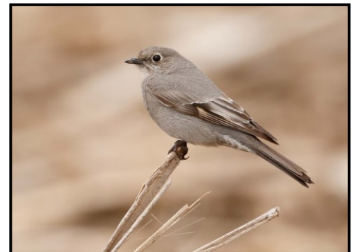
Townsend's Solitaire at Perkinsville Cemetery, Madison Co.