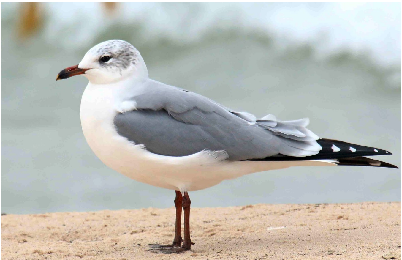
Fig. 8. Close up view of the Michigan City hybrid. Note the similarity to the basic-plumed “Colonel” shown in Fig. 6.

The author is indebted to Amar Ayyash who provided extensive background material and photographs for this report. Amar also reviewed an early draft and offered suggestions that greatly improved the article.