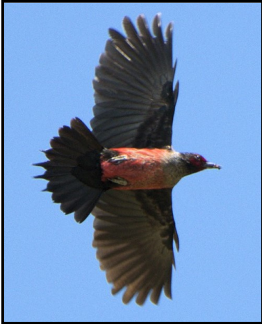
Lewis's Woodpecker.

From Hell Canyon, the birding group took an uphill climb to Elk Mountain, where the burned forest provided good views of Lewis's Woodpecker and Red Crossbill. Rock Wrens were seen well at the lookout. Down below in Roby Canyon, the group was successful in finding Virginia's Warbler, the most northeast breeding population for this species. The special white-winged Dark-eyed Junco was also seen here. This is an endemic sub-species in the Black Hills. Before leaving, not one, but two Western Tanagers were also seen well.