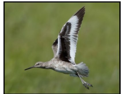
Willet at Goose Pond, Greene Co.