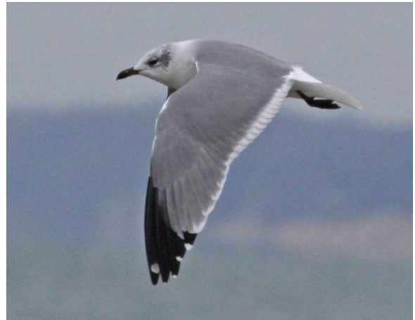
Fig. 1. A flight shot of the Michigan City Harbor hybrid gull on 3 December 2016. Note the pale head markings and the single small “mirror” on the outer most primary.