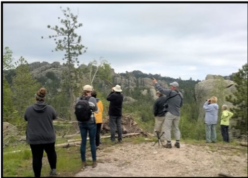
Group birding above Sylvan Lake.

Back south, the group made a late afternoon drive to Sylvan Lake. The high-altitude lake area is often good for crossbills, however none showed up this day. Instead the group was treated to low soaring Osprey, Red-naped Sapsucker, and a pair of Gray Jays. A drive down the needles highway provided awesome views of the Black Hills before heading back for dinner.