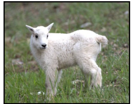
Baby mountain goat in the Black Hills.

Day 6 brought the group back through the Badlands for one last look for two target species. While driving past the Mt Rushmore monument, a pair of mountain goats entertained us on the side of the road. Particularly when their baby came out for all to see. Just before entering the Badlands, two Burrowing Owls were seen, and one target species... Lark Bunting. After entering the park, a bonanza of birds were found. Not 2, not 9, but 29 Burrowing Owls were seen in short order. The park's 30 total for the day may be a site record (at least on eBird). Upland Sandpipers were walking in the open, as