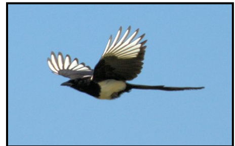
Black-billed Magpie.

The trip then proceeded to Custer State Park. A quick stop at a gas station got Katherine Henman her lifer Brewer's Blackbird before arriving. At the park, the group viewed the new multi-million-dollar visitor center, and did light birding around the building, picking up Yellow Warbler, Black-headed Grosbeak, Cliff Swallows, the first of many Northern Flickers with red shafts, and Lark Sparrow. The group then continued on and did the wildlife loop for looks at Mountain Bluebird, American Bison, and Pronghorn Antelope. Arriving at the hotel in Custer, the group had a late dinner.