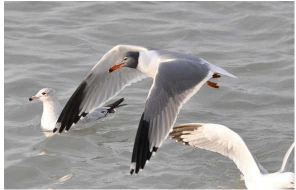
Fig. 5. The “Colonel” in flight at Calumet Park, IL on 11 March 2011. Note that the primary pattern, especially the mirror on p10, matches that of the Michigan City bird shown in Fig. 1.

The “Colonel” In alternate plumage the “Colonel” is superficially similar to a Laughing Gull. Compared to a pure Laughing Gull it is larger (about the size of a Ring-billed Gull as seen in Fig. 4.), has a paler mantle tint, a gray hood (paler around the eye), and orange (rather than black legs). Amar observed the birds shown in Fig. 4 copulating, revealing that the “Colonel” was in fact a female, as the male Ring-billed mounted her several times. Ayyash (2010) also heard the bird vocalize and described the sound as similar to a “nasally Ring-billed.” A photo of the bird in basic plumage appears in Ayyash (2016) and is illustrated in Fig 6. Amar also believes that more than one hybrid has occurred in the Chicago area (personal comm.).