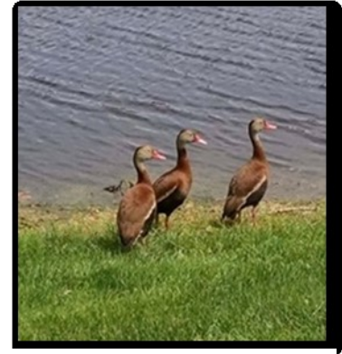
Black-bellied Whistling Ducks in Terre Haute (Vigo Co.).

White-faced Ibis - First seen as three unidentified Plegadis ibis flying over Goose Pond, Greene , on 6 April (Travis Stoelting), the birds were relocated and identified on Apr 10 (Amy Kearns and Gary Langell).