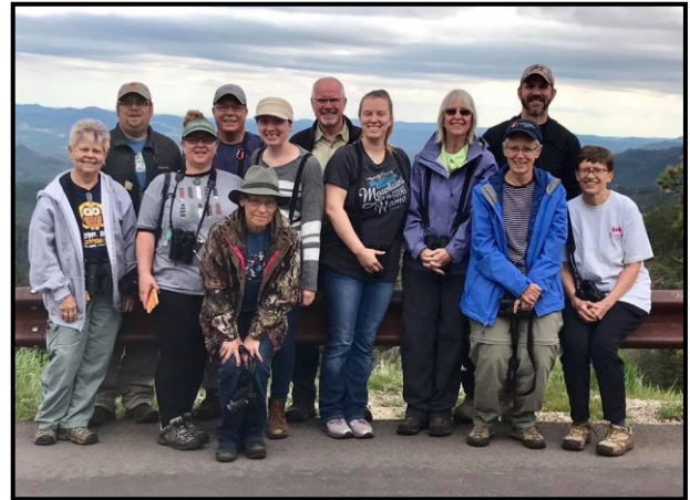
Happy birders in the Black Hills, June 3-9, 2017.

Participants met at Cool Creek Park at 9am on Saturday, and drove a nonstop 12-hour drive to Sioux Falls, SD. Very little birding was done that day. We met three other participants in Sioux Falls, who joined us the next day.