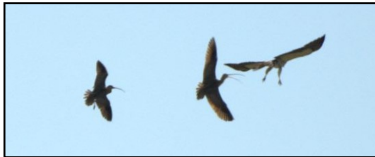
2 Long-billed Curlews driving away a Swainson's Hawk in Badlands National Park.

well as 4 Long-billed Curlews. About this time, an adult Swainson's Hawk kettled overhead, sending two curlews up in the air to intercept. It was a jaw dropping experience for us Indiana birders. More curlews would be seen as we continued into the park, while also adding our one and only Brown Thrasher on the trip. On the drive back to Sioux Falls, American White Pelican were seen in a nearby pond.