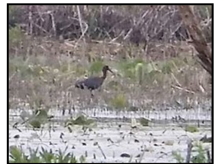
Glossy Ibis at Kingsbury FWA, Laporte Co. on May 20.