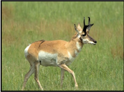
Pronghorn Antelope were common in Custer and Wind Cave.

Lewis's Woodpecker, but could not find the elusive Black-backed Woodpecker. A stop along Stockade Lake also failed. But goodies were still seen, including a feeding Red-tailed Hawk, Great-blue Herons, and Western Tanager. Dinner was held in the famed State Game Lodge, where the group was treated to close up views of American Elk on the drive back to Custer.