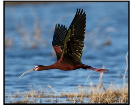
White-faced Ibis in Graysville Bottoms, Sullivan Co., May 30.