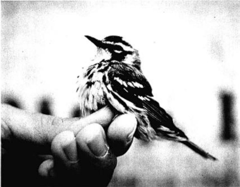
FIGURE 2. The adult Yellow-throated Warbler captured and banded on Southeast Farallon Island 8 July 1969. First California occurrence. Photograph by Henry Robert.

1975 and 25 June and 1 July 1968. Tenaza (1967) collected four in June and July 1965, the latest being one on 3 July 1965.