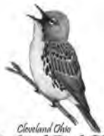
Cleveland Ohio Kirtland Bird Club

Non-Profit Organization U.S. Postage P A I D Cleveland, Ohio Permit No. 2831