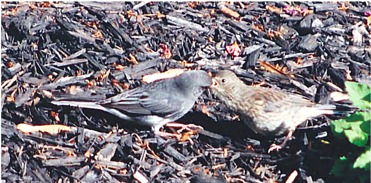
Adult Junco Feeding Juvenile, Mayfield Heights, 5/24/2009

While it seems quite odd that these juncos should go "suburban" and forgo their hemlock forests to nest in an urban setting, Nolan et. al. (op. cit.) does list the following nest-sites (if not specific locality): "...on supports beneath buildings that are elevated on stilts or pillars...on window ledges, beams, light fixtures; in hanging flower pots...or under buildings." As all of the above are readily available in, or near the Dunlap's yard, it is not unreasonable to suggest that the nesting juncos chose a protected spot underneath a latticed porch.