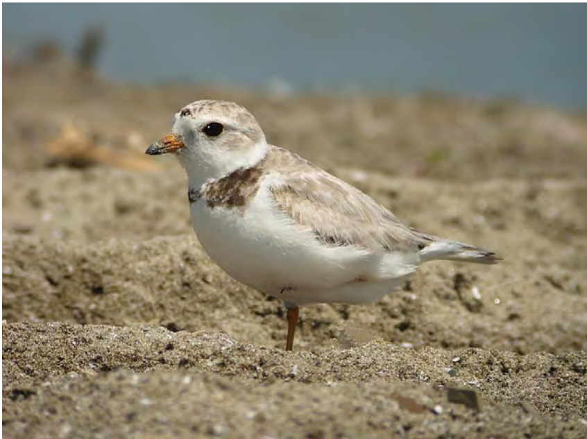
Piping Plover, Conneaut Harbor, 7/27/2009 Jerry Talkington