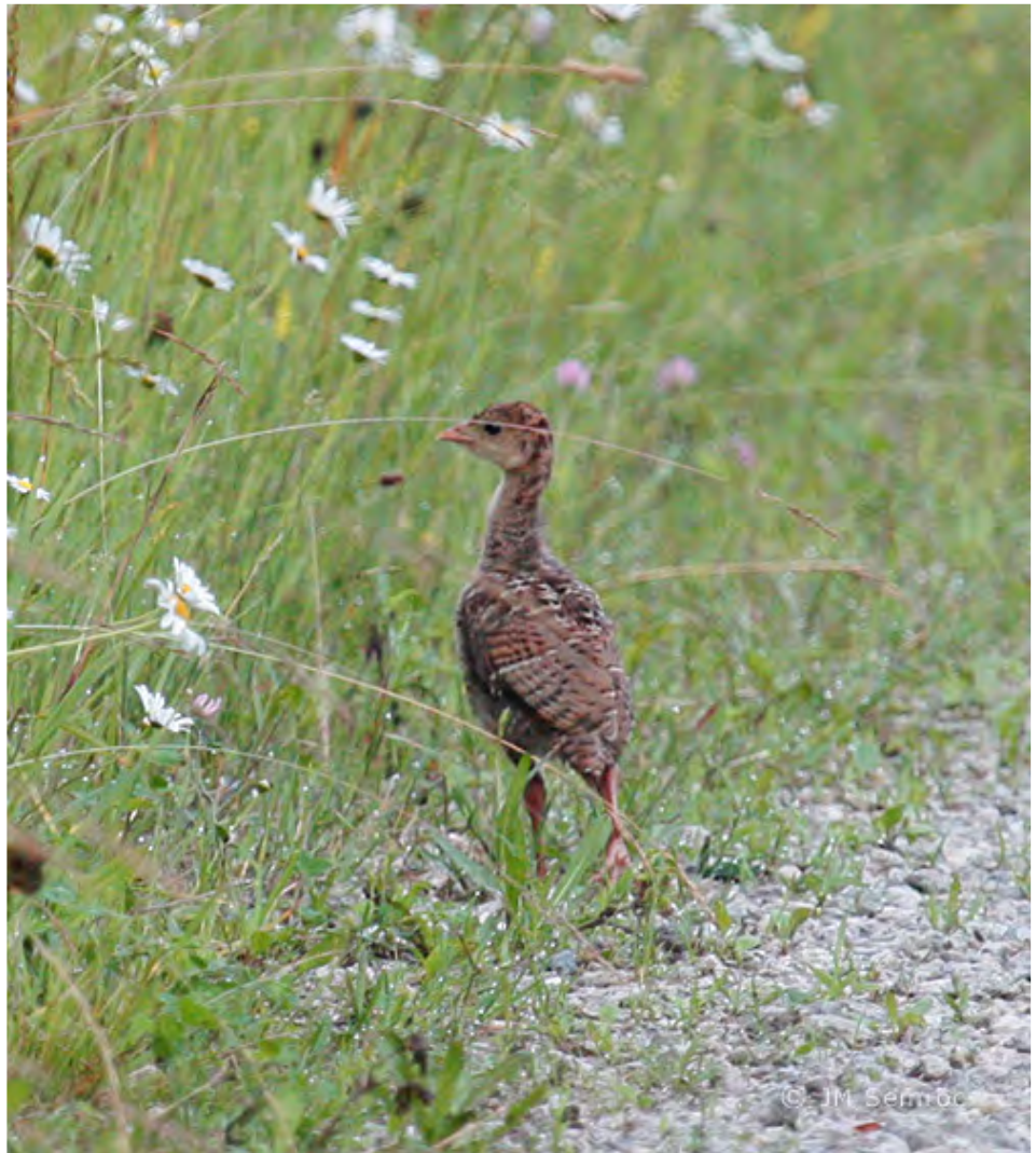
Wild Turkey Poullet, Camp Ravenna, 6/28/2009

Wildwood Park Cleveland Lakefront State Park at Neff Road (Cuyahoga County).