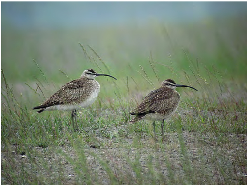
Whimbrels, Fairport Harbor, 6/19/2009 Jerry Talkington

beach early on the morning of 7/23 (RH).