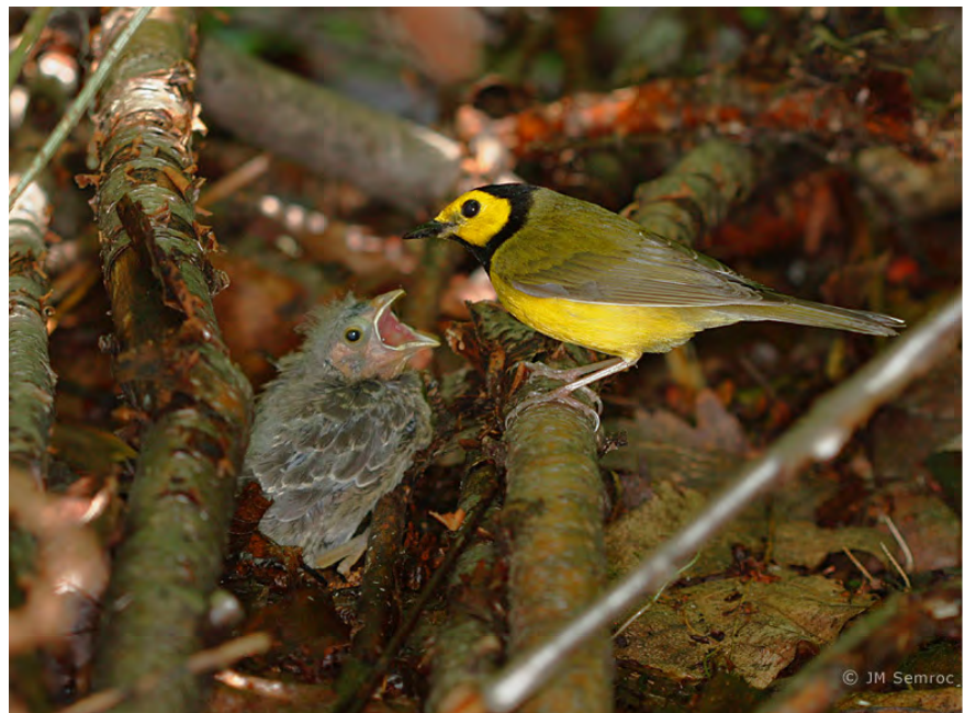
Hooded Warbler with young Cowbird, Thompson Ledges, Geauga County, 6/12/2009

Ovenbird. Few reports. Two were observed on 6/14 at Hampton Hills (CC, TMR) and Oak Hill in the CVNP had three on 7/4 (DAC). Probable