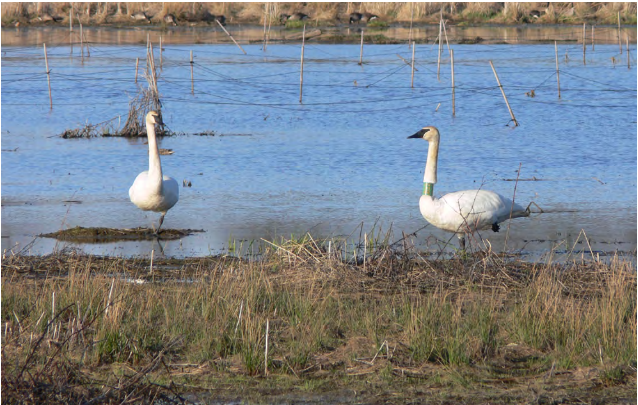
Trumpeter Swans, Orwell, 4/18/2009

Common Loon. A breeding-plumaged individual flew past the Headlands Nature Preserve beach on 8/25 , the first August record there for Ray Hannikman (RH).