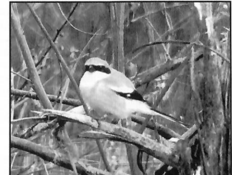
In Adams Co, 19 Mar on its way north was this loggerhead shrike; the band is from the Ontario reintroduction project.