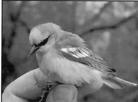
An SY male blue-winged warbler captured for banding 22 April at HWSP.

Blue-winged warbler: First reported 22 Apr s. of Columbus (B. Royse), with one at Magee within five days (R. Nirschl). The CVNP had good numbers as usual, with 55 on the census of 12 May.