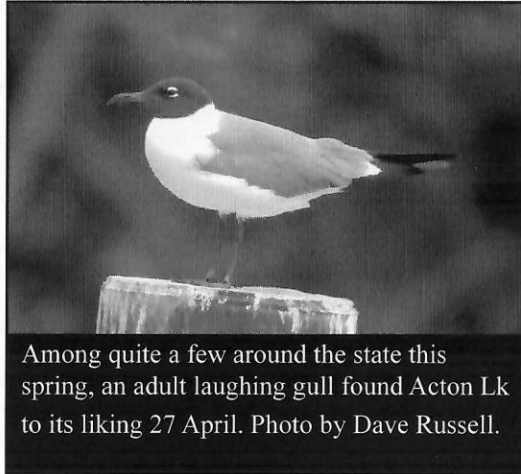
Among quite a few around the state this spring, an adult laughing gull found Acton Lk to its liking 27 April.