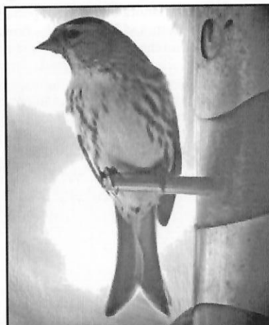
Surely among the most unexpected spring appearances was that of a common redpoll at a feeder in Worthington, Franklin Co on 12-15 Apr.