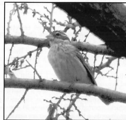
On 2 May, this disconsolate female rose-breasted grosbeak, a first for this Cincinnati location, regards a mulberry tree devastated by the April cold snap.