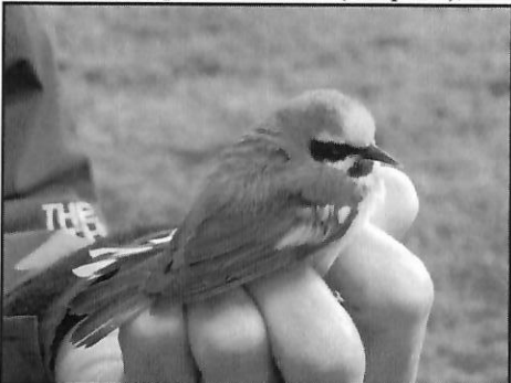
A male golden-winged warbler mist-netted on the OSU campus 3 May by S. Matthews.

Golden-winged warbler: All reports follow: male 28 Apr Shawnee SF (B. Sparks), 30 Apr in Paulding (M&D Dunakin), male Tiffin 1 May (T. Bartlett), male The Wilds 3 May (J. Larson), 3 May OSU campus (S. Matthews vide P. Rodewald), 4 May at BCSP (D. Overacker), Blendon Wds MP in Columbus 5 May (D. Linzell), Delaware SP 5 May (Jack Stenger), in Licking 6-8 May (C. Dusthimer), male with atypical song Highbanks MP in Delaware 7 May (R. Lowry), OSU campus 7 May (A. Boone), birds netted at Navarre 7 & 9 May (BSBO), female OSU campus 8 May (D. Horn), Magee Marsh 8 May (R. Nirschl), two at Metzger 8 May (M. Anderson), two at Riverbend in Hancock 8 May (B. Hardesty), 8 May in the CVNP (D. Chasar), singing male 22 May at Battelle-Darby MP in Franklin (J. Kuenzli).