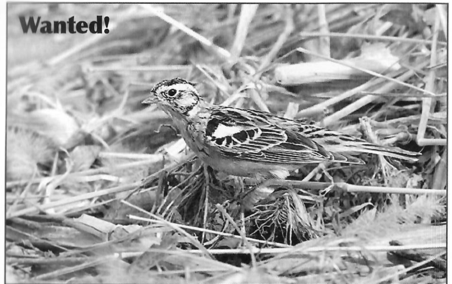
Have you seen this bird? Once regular by the hundreds in spring in Ohio, the Smith's longspur has been recorded only once in the past dozen years. This male is standing next to seed-heads of foxtail ( Aristida sp.) in a corn-stubble field--prime habitat for migrant Smith's.