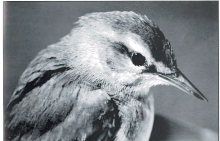
This Swainson's warbler managed to find itself in one of the Black Swamp Bird Observatory's nets at Navarre Marsh, Ottawa Co. It was banded on 28 April 1998 and was relocated two days later. Photo by Bruce Simpson on 28 April 1998.