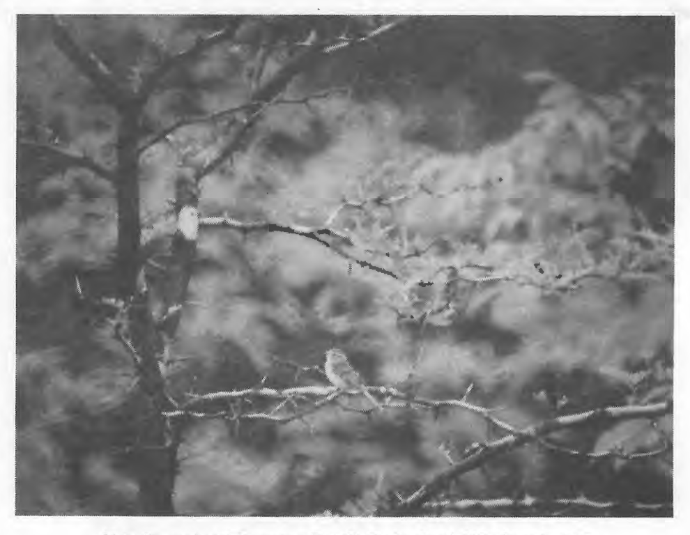
Male Clay-colored Sparrow. Battelle-Darby Creek MP, June 6, 1996

[Editor's note: this record has yet to be reviewed by the Ohio Bird Records Committee].