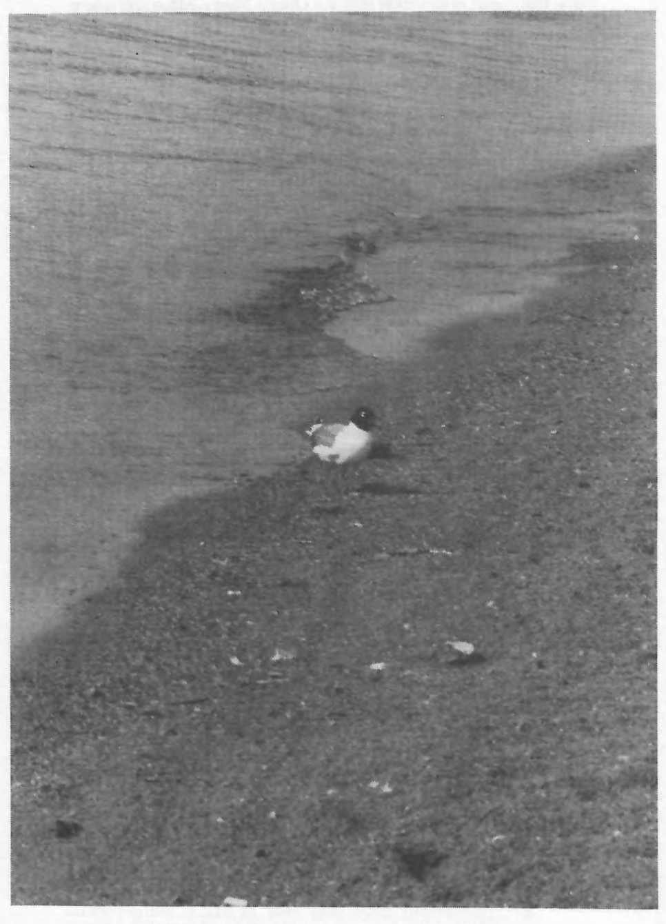
Adult Franklin's Gull. Caesar Creek SP, 7/31/96.