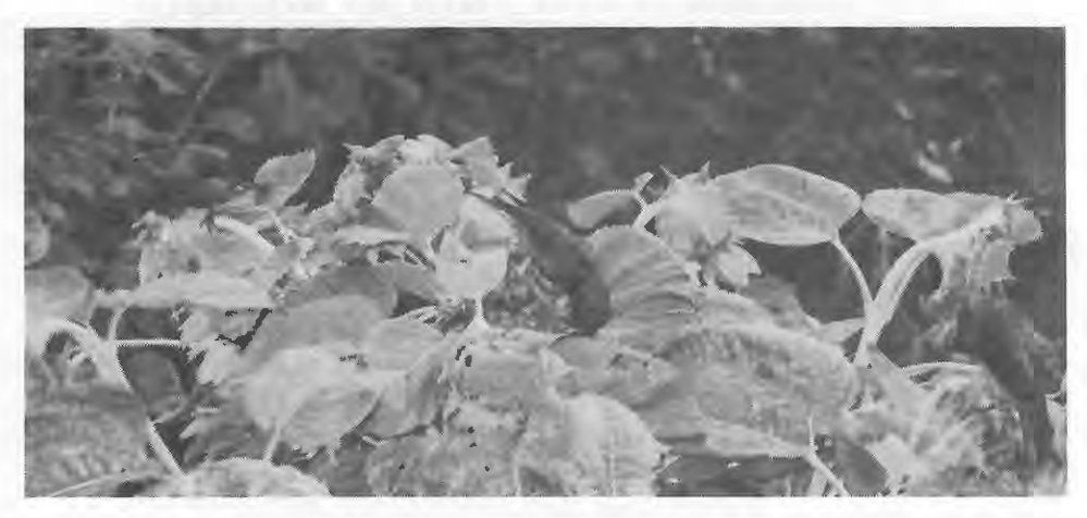
Red Crossbills. Elmore (Ottawa Co.), 7/30/96.

"The Reports" section is intended to be read in phylogenetic order. Although the following accounts use the most current specific names as dictated by the American Ornithologists' Union, the order of appearance does not yet reflect the most current changes. County names are sometimes abbreviated by using their first four letters— "Holm" representing Holmes County, for example. Other place name abbreviations found in this issue are: BuCr (Buck Creek State Park, a.k.a. C.J. Brown Reservoir, Clark Co.); CVNRA (Cuyahoga Valley National Recreation Area, Cuyahoga/Summit Cos.); FRes (Findlay Reservoirs, Hancock Co.); GLSMFH (Grand Lake-St. Mary's Fish Hatchery, Auglaize Co.); HBSP (Headlands Beach SP, Lake Co.); HHMP (Hell's Hollow Metropark, Lake Co.); Klbk (Killbuck Wildlife Area, Wayne/Holmes Co.); KPWA (Killdeer Plains WA, Wyandot Co.); Lksh (Lakeshore MP, Lake Co.); Magee (Magee Marsh WA, Ottawa/Lucas Cos.); MCMWA (Mallard Club Marsh WA, Lucas Co.); Metzger (Metzger Marsh WA, Lucas Co.); MWW (Miami-Whitewater Wetlands, Hamilton Co.); OkOp (Oak Openings MP and vicinity, mostly Lucas Co.); ONWR (Ottawa National Wildlife Refuge, Ottawa/Lucas Cos.); PCWA (Pickerel Creek WA, Sandusky Co.); & SVWA (Spring Valley WA, Greene/Warren Cos.).