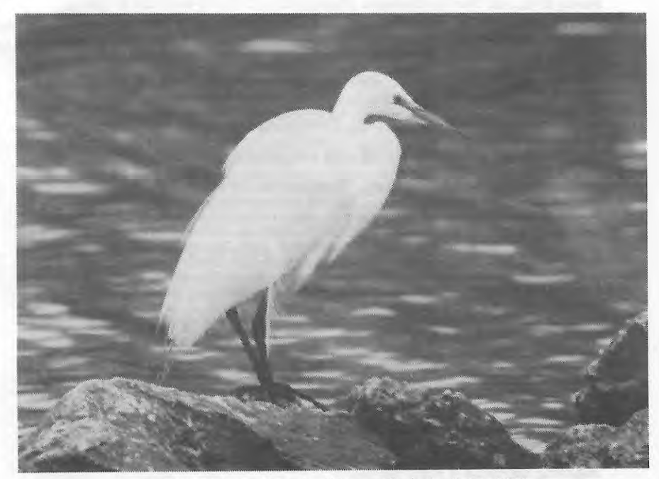
Great Egret. S. Bass Is. (Ottawa Co.), April 18, 1996

Once again, the Black Swamp Bird Observatory operated a bird banding site at the Navarre Unit of Ottawa National Wildlife Refuge (Ottawa Co.), behind the Davis-Besse Nuclear Power Station. This site was manned every day, weather permitting, from mid-April to early June. Strong movements were noted April 25, May 3, May 8-10 (a single-day capture record occurred May 10 with 1260 individuals banded), May 18-23, and May 31-June 1. A total of 9255 individuals representing 105 species were banded at Navarre. The top 10 species banded were as follows: Magnolia Warbler-- 942; Common Yellowthroat-- 518; Arm. Redstart-- 517; Swainson's Thrush-- 476; White-throated Sparrow-- 423; Yellow Warbler-- 420; Yellow-rumped (Myrtle) Warbler-- 379; Gray Catbird-- 318; "Traill's" Flycatcher-- 302; & Red-eyed Vireo-- 278. This data was reported in <u>Dendroica</u> 4(1):12, a publication of the Black Swamp Bird Observatory. BSBO, P.O. Box 228, Oak Harbor, OH 43449.