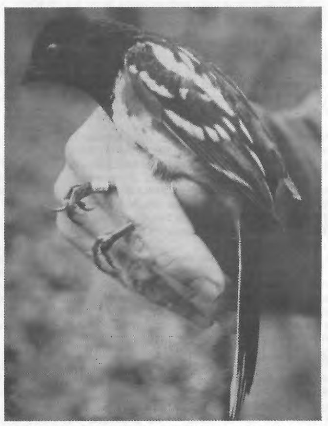
Spotted Towhee. Springville Marsh SNP (Seneca Co.), May 4, 1996.

[Editor's note: The above observation represents a new species for Ohio, being the first record accepted by the Ohio Bird Records Committee. This article first appeared in <u>The Cleveland Bird</u> <u>Calendar</u> 92(4):48-49.]