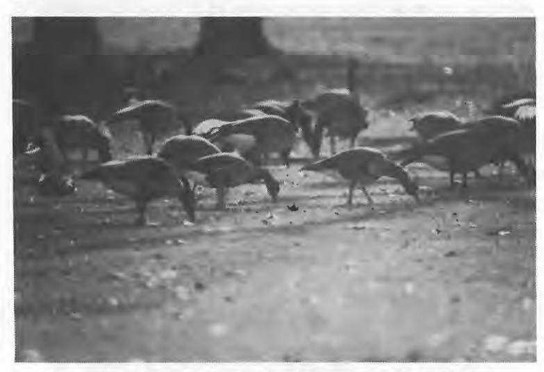
Greater White-fronted Geese. Castalia Pond (Erie Co.), 10/28/95.

The "Reports" section is intended to be read in phylogenetic order. The specific county location of most sites is listed in the accounts the first time each site receives mention. County names are often abbreviated by using their first four letters-- "Paul" representing Paulding County, for instance. Other place name abbreviations found in this issue are: BuCr (Buck Creek State Park, a.k.a. C.J. Brown Reservoir, Clark County); CVNRA (Cuyahoga Valley National Recreation Area, Cuyahoga/Summit Cos.); DGG (Donald Gray Gardens, Cuyahoga Co.); FRes (Findlay Reservoirs, Hancock Co.); HBSP (Headlands Beach SP, Lake Co.); KPWA (Killdeer Plains Wildlife Area, Wyandot Co.); Lksh (Lakeshore Metro Park, Lake Co.); Magee (Magee Marsh WA, Ottawa/Lucas Cos.); Metzger (Metzger Marsh WA, Lucas Co.); ONWR (Ottawa National Wildlife Refuge, Ottawa/Lucas Cos.); ONWRC (Ottawa NWR Count, Ottawa/Lucas Cos., as compiled by Ed Pierce); & SVWA (Spring Valley WA, Greene/Warren Cos.).