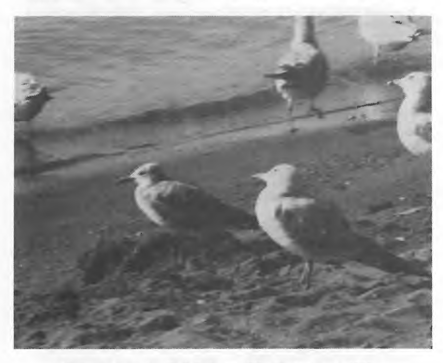
First-year Laughing Gull, Delaware SP. September 4, 1995.

All individuals contributing bird reports to "The Ohio Cardinal" for the Autumn 1995 season (August 1 to November 30, 1995) are listed below in CAPITAL LETTERS. In addition, many other Observers submitted sightings to other birding-related publications. For this issue, reports from the following publications have been used: "The Cleveland Bird Calendar" (Kirtland Bird Club), "Passenger Pigeon" (Cincinnati Bird Club), "The Redstart" (Brooks Bird Club), Wheeling, WV), "The Toledo Naturalists' Association Bulletin", "Wingtips" (Black River Audubon Society), and "The Yellow Warbler"