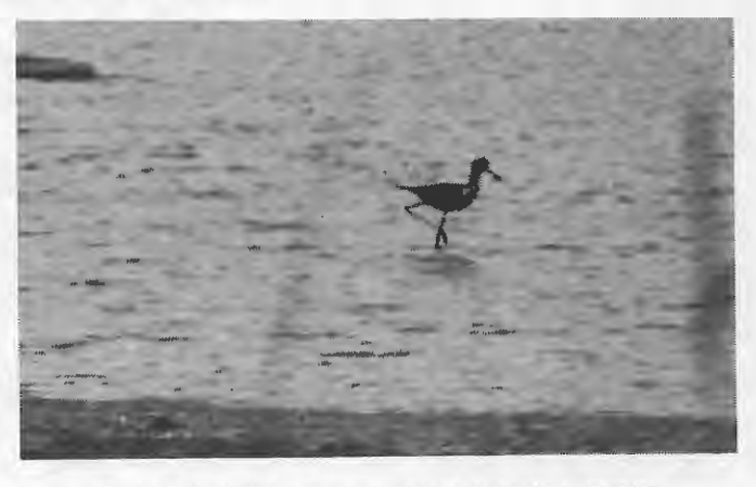
Black-necked Stilt. Conneaut (Ashtabula Co.), 11/9/95.

Since March 1994, the OBRC has been an institutional member of the Ohio Biological Survey; since 1912 Ohio's premier organization charged with disseminating information about Ohio's biota. Under the OBS Small Grants Program, this year the OBRC applied for and won an institutional grant for the "Electronic Archival of Ornithological Photographic Voucher Specimens". With these monies we will be placing the first lot of 100 rare photographic documentations on CD ROM.