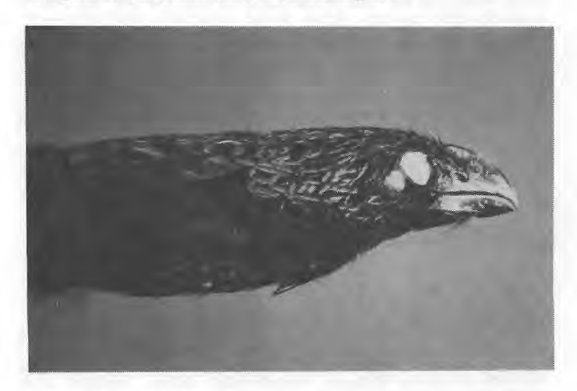
Figure 1. Smooth-billed Ani. Westlake (Cuyahoga Co.), Nov. 25, 1993.

We contacted curators and registrars at regional zoos and at ISIS (International Species Inventory System), but found no records of captive anis that could have escaped. This fact and the bird's poor condition strengthened our opinion that it was a true vagrant.