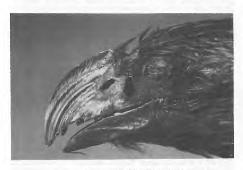
Figure 2. Groove-billed Ani, CMNH #6206.

May we at least assume that anis with a highly arched culmen and a pronounced angle of the culmen with the skull to be SBAs? This may be true most of the time. Yet GBA #6206 in the CMNH collection (Figure 2) has pretty close to that profile, but has grooves on the bill as well. Missing feathers emphasize the angle, certainly, but the culmen ridge is still moderately high. Remsen, writing of SBAs' high arch, says "...variability is so great that its usefulness is limited to extreme cases. Rest assured that your specimen matches many of our Smooth-billeds in its bill profile."