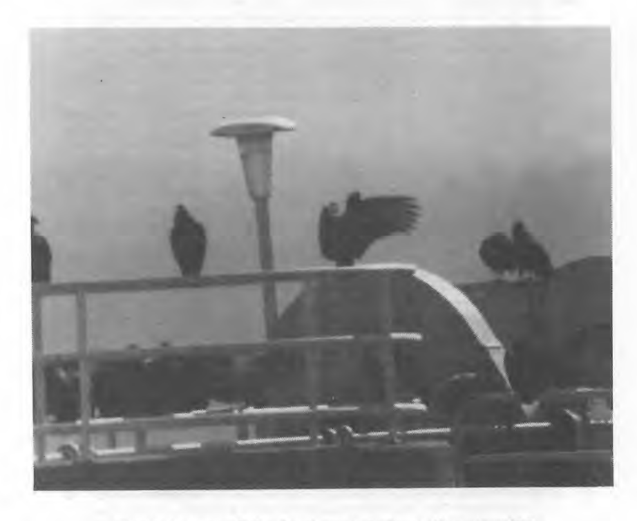
Black Vultures. Paint Creek Lake Spillway, Nov. 19, 1995.