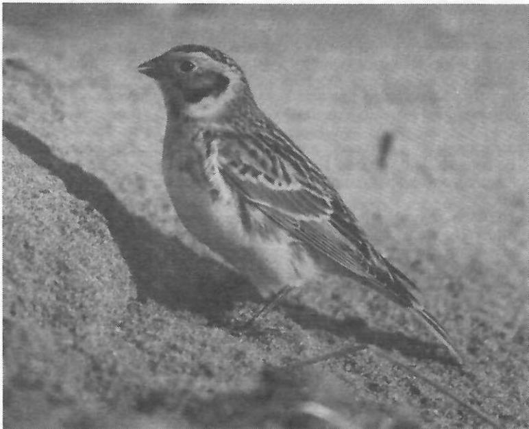
Lapland Longspur. Conneaut (Ashtabula Co.), Autumn, 1994.