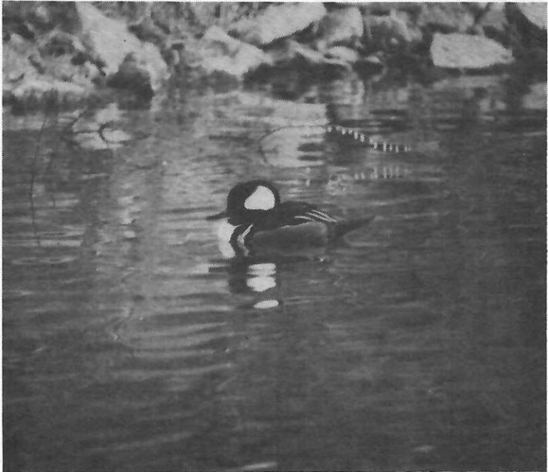
Hooded Merganser. Castalia Pond (Erie Co.), Winter 1994-95.