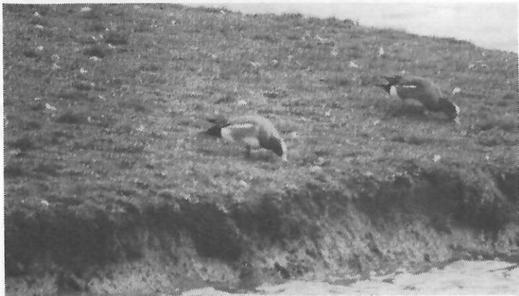
Eurasian and American Wigeon. Hoover Reservoir. April 11, 1993. [Currently under review by the Ohio Bird Records Committee.]