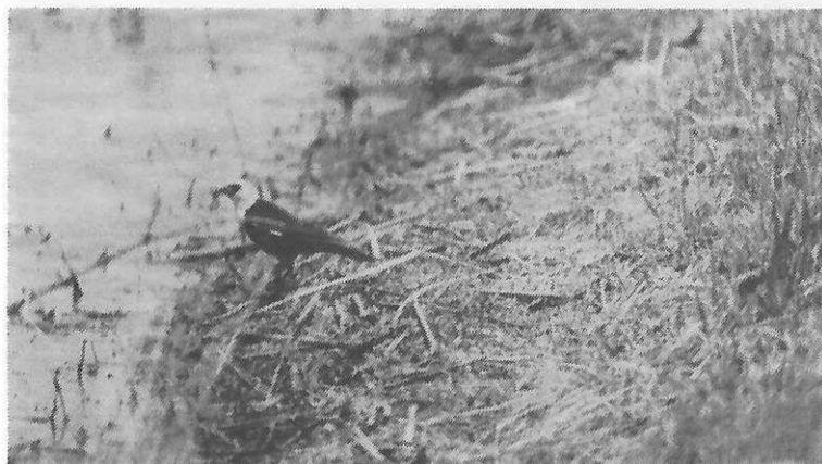
Yellow-headed Blackbird. Mallard Club Marsh WA. May 17, 1993.

[Editor's note: The above record is currently under review by the Ohio Bird Records Committee.]