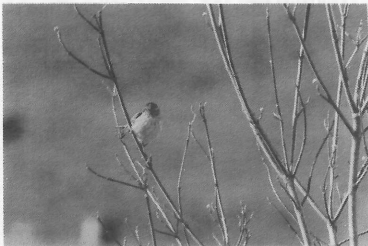
Palm Warbler. Holmes Co. Feb. 2, 1993.