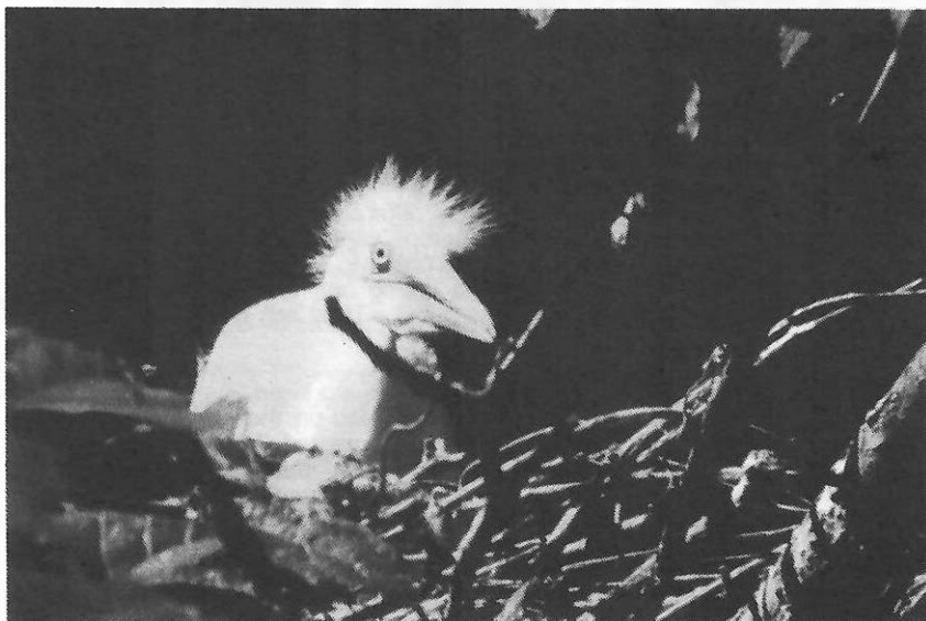
Great Egret young in nest, West Sister Island, July 5, 1992

All of this greeted us when we came ashore on July 5, 1992. This trip