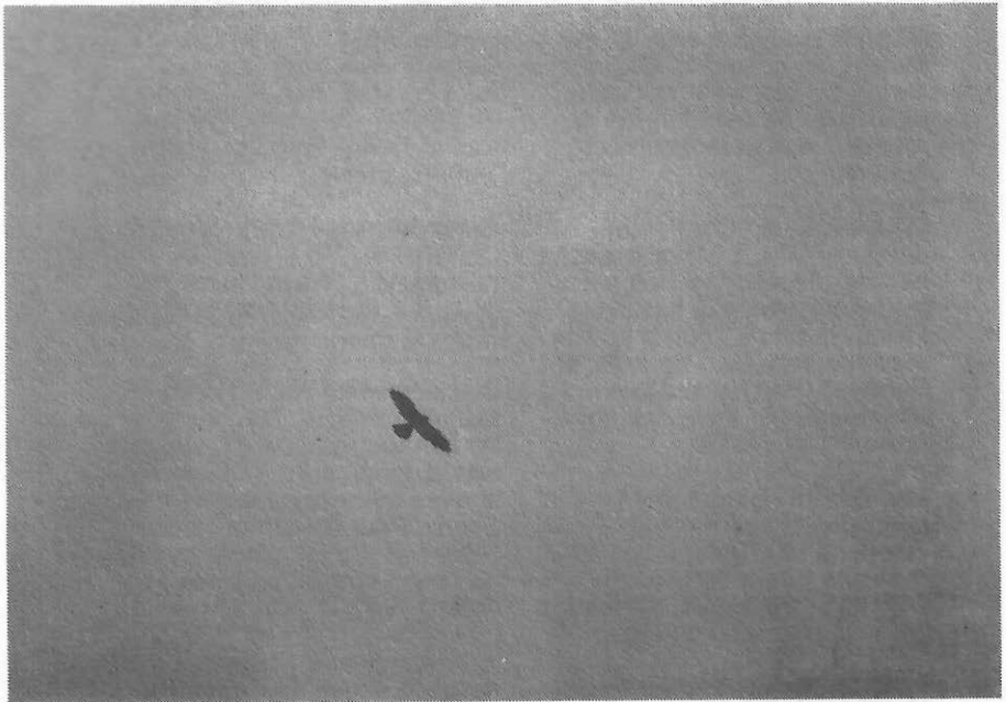
Mississippi Kite. Denmark Twp., Ashtabula Co. June 7, 1992.