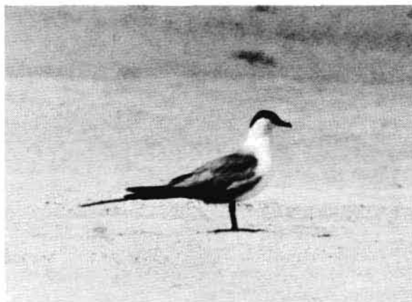
Figure 1. Long-tailed Jaeger.

Unlike the majority of jaegers observed in the fall, this bird appeared in nuptial plumage (Figure 1). The long tail streamers, its most striking feature, were still quite prominent, extending well beyond the folded wings; its underparts were white or slightly offwhite with no trace of the barring prominent on winter-plumaged birds; and in good light the yellowish wash typical of breeding condition could still be detected on the bird's cheek and upper neck. In addition, the white at the base of the primaries characteristic of the jaegers was limited to the two outermost primaries, which definitively separated this bird (Figure 2) from the Parasitic Jaeger ( S. parasiticus ). Also, the tarsi of the bird were dark gray or blackish, which is consistent with descriptions of some individuals of this species (Cramp 1983), although the tarsi of most individuals have a bluish cast. Because this bird did not closely associate with any other bird while under observation, it was difficult to judge its size. However, its buoyant and agile flying was entirely in conformance with descriptions of the flight of S. longicaudus (Cramp 1983).