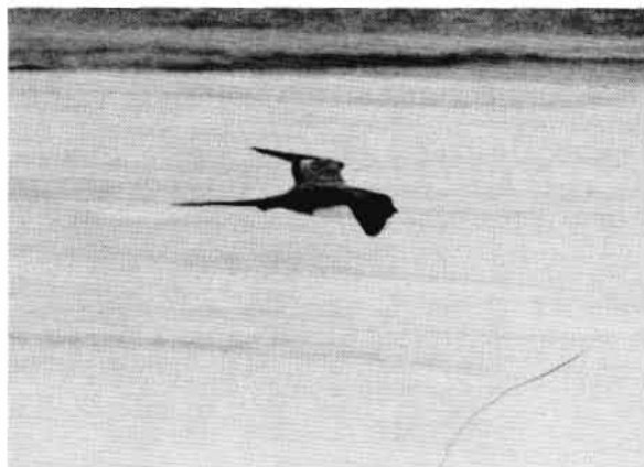
Figure 2. Long-tailed Jaeger in flight.

Migrants of this species do not normally feed extensively while in passage (Cramp 1983), but while under observation on 2 September this bird was noted hawking for insects, which it readily captured after swift pursuit. This behavior was also noted on 4 September (D. T. Crawford pers. comm.). The bird consumed all of each prey item it was seen to capture. On one occasion it swallowed an insect, and in the process of swallowing it one wing of the insect fell to the ground; the bird retrieved and swallowed the wing, although the nutritional value which it offered must have been minimal. Additionally, the bird picked up small items from the ground and ingested them; these may have been edible items or grit. If the latter, it would represent an infrequently noted feeding behavior as Bent (1921), Terres (1980), Pforr and Limbrunner (1981), and Cramp (1983) do not mention it in their discussions of this species' food habits.