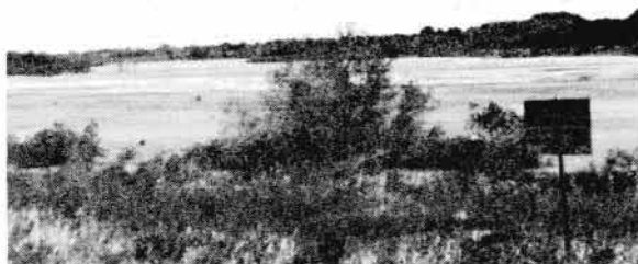
Figure 1. Ash disposal pond at GSP, looking northeast.

The ash disposal area is essentially the same as previously described ( The Migrant 43:90) except that the area of exposed ash is much larger, covering approximately half of the entire disposal area.