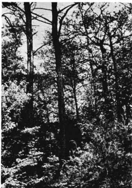
Figure 2. The Daddy's Creek nest site, May 1974, Cumberland County, Tennessee.