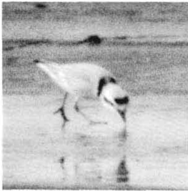
Figure 2. Snowy Plover.

The bird behaved in typical small plover fashion. While feeding, it darted very rapidly from place to place, pausing momentarily to peck at the surface of the ash, then darting on. At times, it moved several hundred meters in a surprisingly short time.