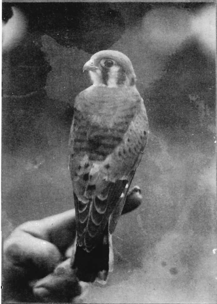
A tame Sparrow Hawk