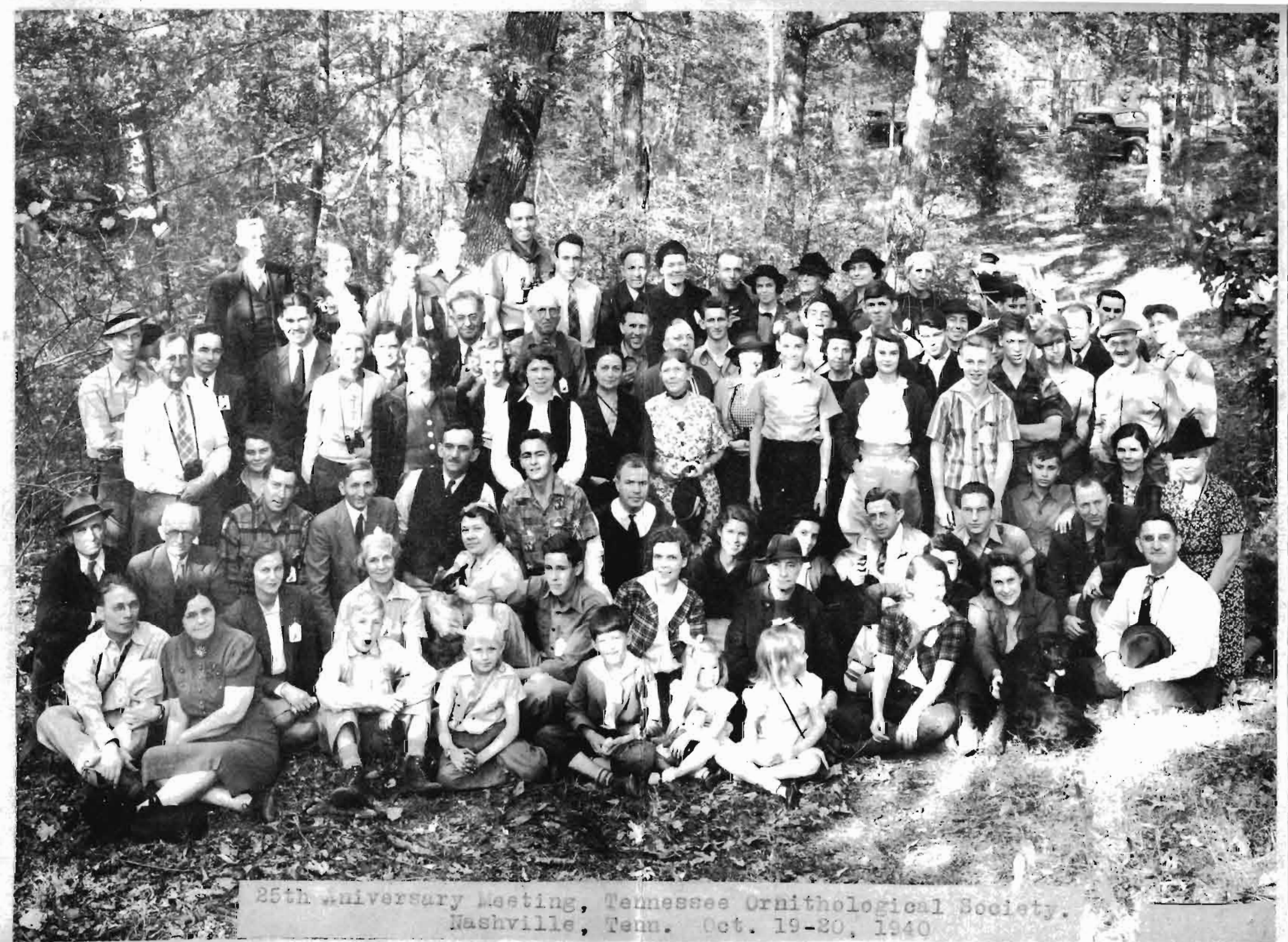
25th Anniversary Meeting, Tennessee Ornithological Society. Nashville, Tenn. Oct. 19-20, 1940