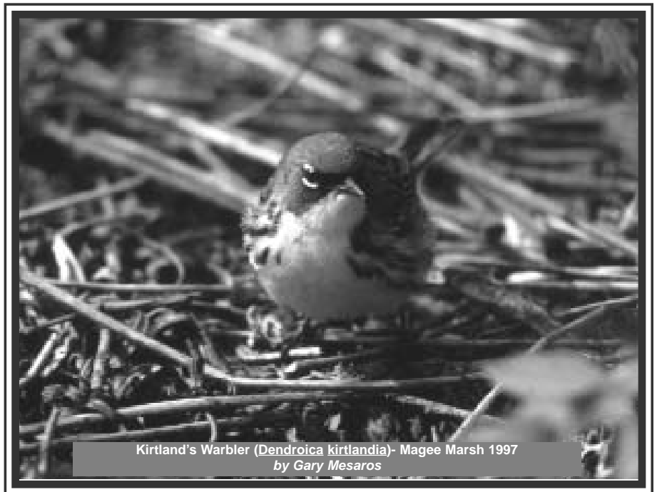
Kirtland's Warbler ( Dendroica kirtlandia )- Magee Marsh 1997 by Gary Mesaros

As an example the depth of coverage presented in the text, I examined two species in particular, Northern Waterthrush and Louisiana Waterthrush. One might think that these species, being rather nondescript, might warrant less attention than species with many plumage variations. Yet this is not the case--most species in this book average about nine or ten pages of treatment, while Northern and Louisiana Waterthrush receive 10.5 and 7.5 pages, respectively. Regarding the 12 categories listed above, I took the time to count the number of