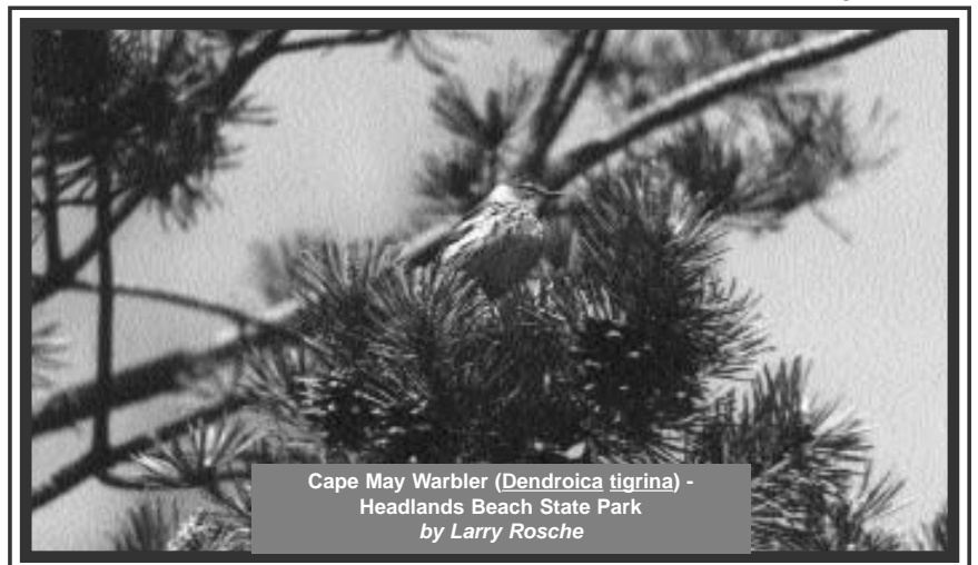
Cape May Warbler ( Dendroica tigrina) - Headlands Beach State Park