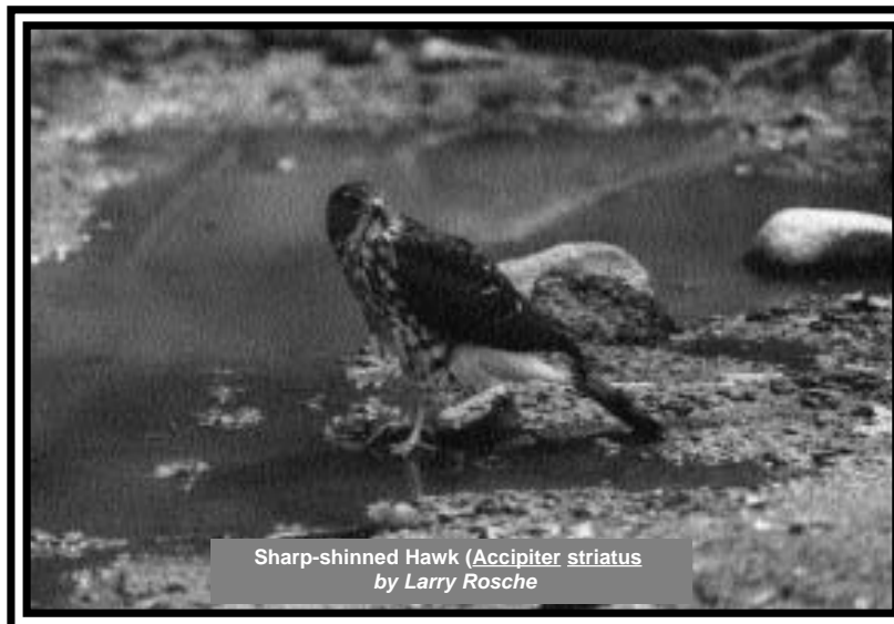
Sharp-shinned Hawk ( Accipiter striatus )

There were 7 reports of Ospreys from Geauga Co. The latest was Oct. 29 (fide DB). At HBSP, Ospreys were noted on 3 occasions (RH). Bald Eagles continue to show up at almost any lake or lakefront