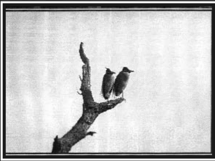
Yellow-crowned Night-Herons – Streetboro Bog