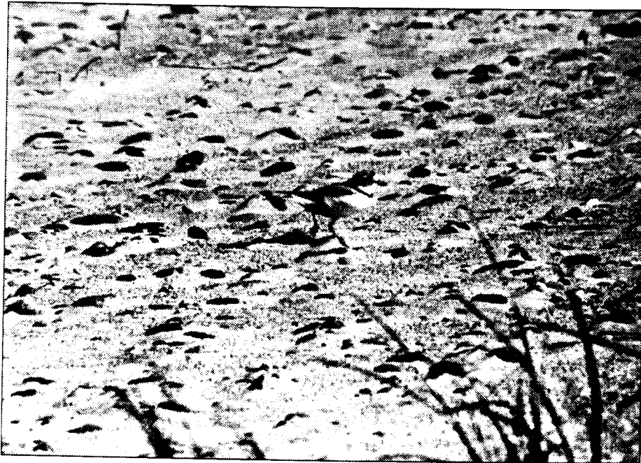
Piping Plover ( Charadrius melodus )- Lake Superior Beach, MI by Bert Szabo