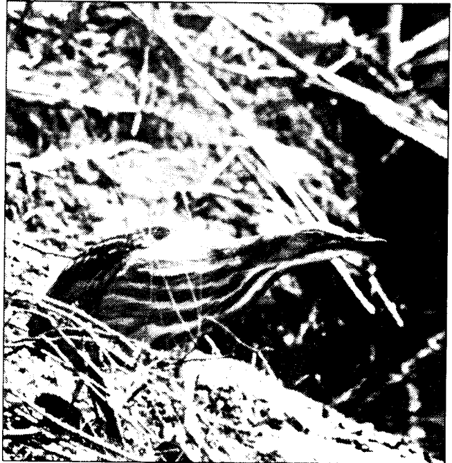
American Bittern ( Botaurus lentiginosus) - 29 April 1995 Shaker Lakes