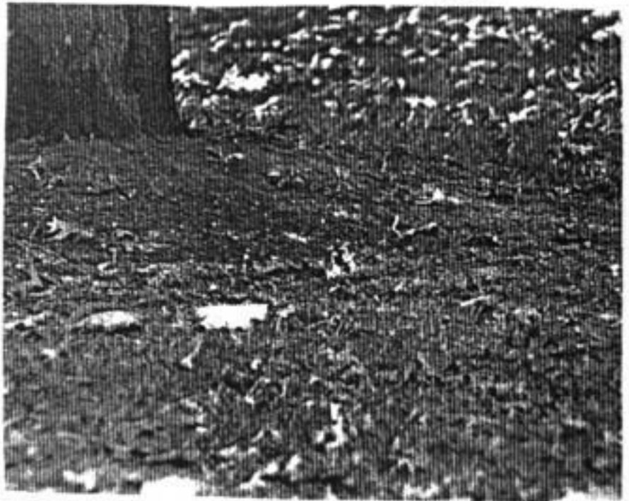
Harris Sparrow - Lakewood City Park 26 October 1991