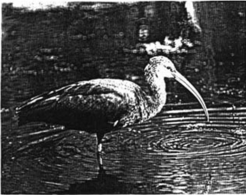
White-faced Ibis - Spencer Lake 13 October 1991 by Bruce Glick