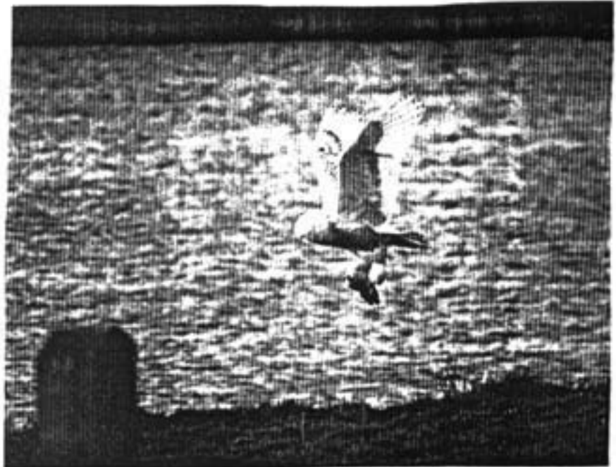
Snowy Owl and Bufflehead - E. 55th St. 24 November 1991 by Melinda Greenland

Flight: Flight was graceful and effortless, usually several wing beats followed by a low glide over the surface of the water. Much wing flapping was observed as the bird fought both the brisk winds and the attacks of Herring and Ring-billed gulls, and as it dipped to lake level as if to feed.