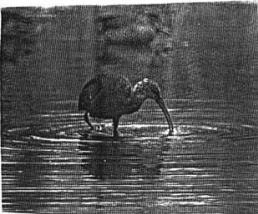
White-faced Ibis - Spencer Lake State Wildlife Area 13 October 1991

(Editors note: Photographs by Bruce Glick clarified that this was a White-faced Ibis ( Plegadis chihi ) They clearly showed the red in the eye and the absence of the bluish facial outline characteristic of a Glossy Ibis ( Plegadis falcinella ). This established the first [2nd] record of the White-faced Ibis in the Cleveland region.