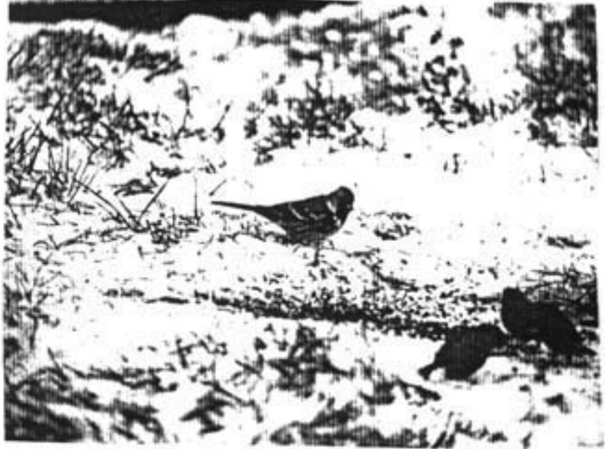
Harris Sparrow - Carlisle Visitor Center 7 November 1991

Clay-colored Sparrow - An immature was feeding in a large mixed flock of spizella sparrows at