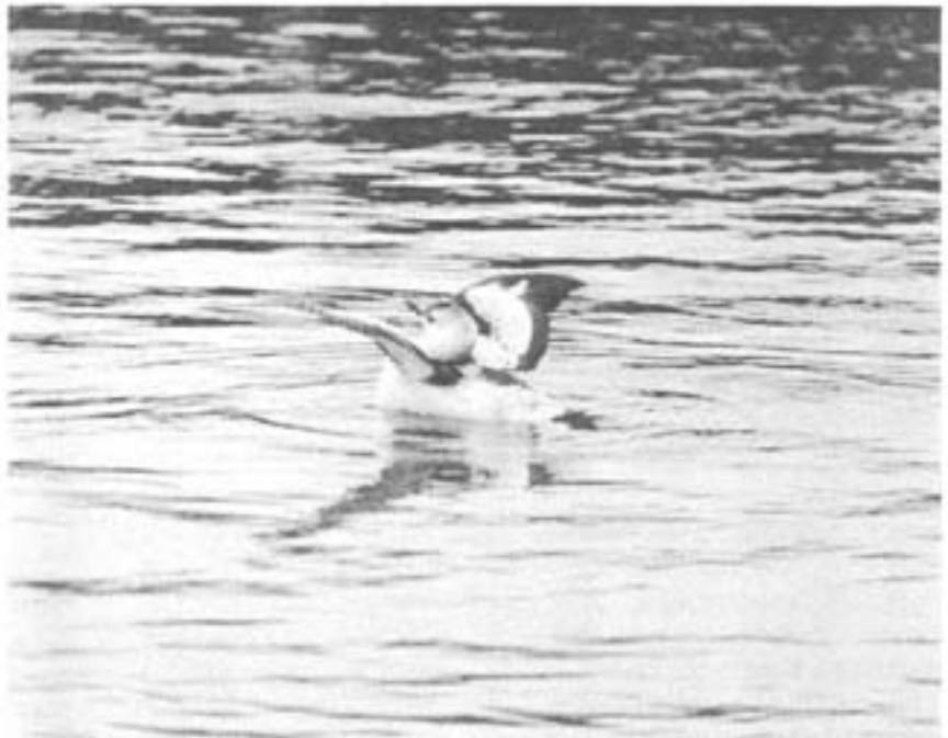
Black Guillemot

James Bay rather than from the Atlantic Ocean via the St. Lawrence River.