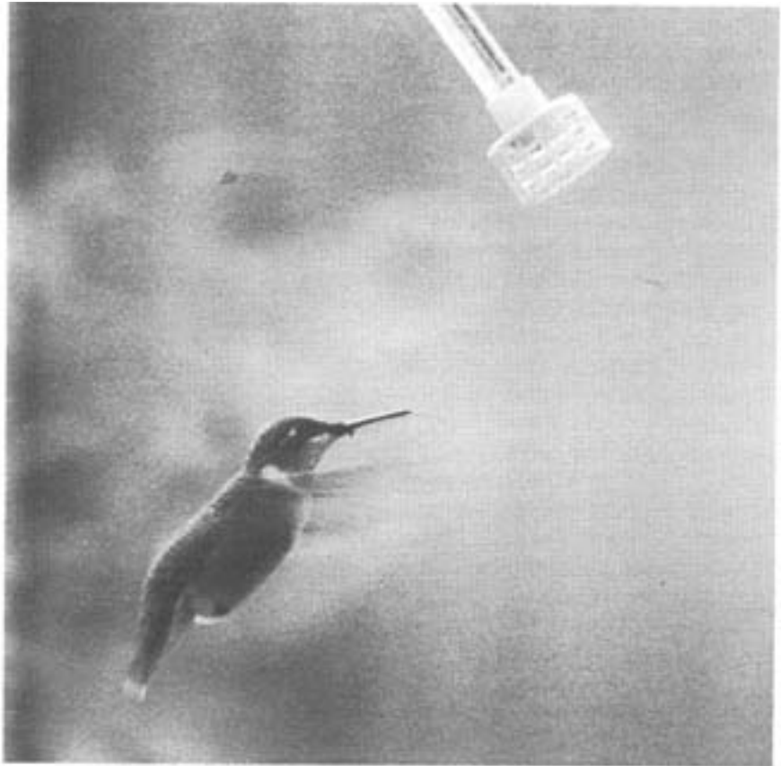
Immature Ruby-throated Hummingbird