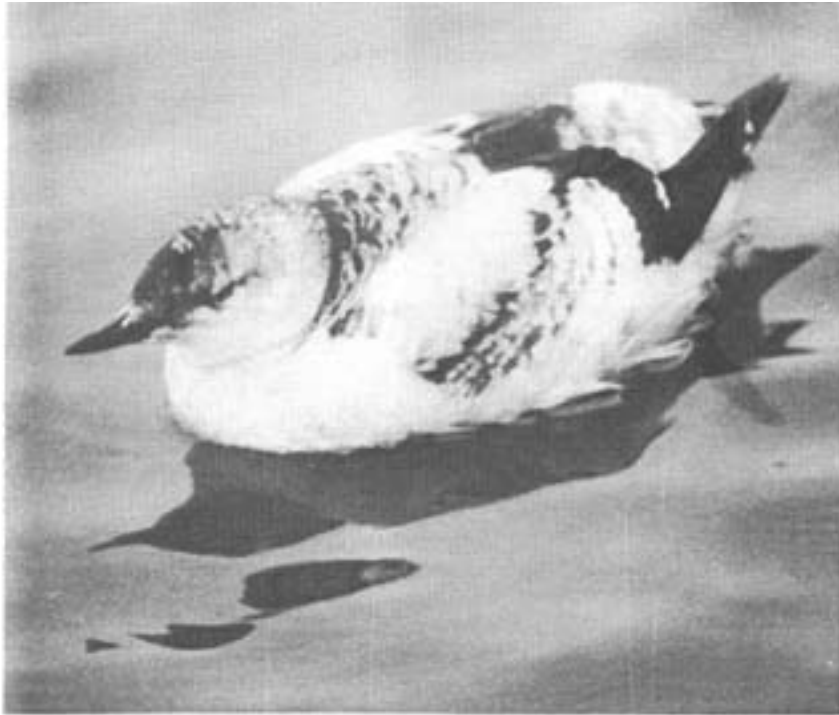
Black Guillemot by Bruce Glick