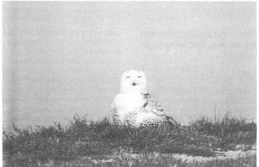
Snowy Owl - 18 November 1990 - Cleveland, Ohio by Melinda Greenland

was seen in the dunes area at Headlands BSP on 18 Nov. (Bacik, Fjeldstad). A bird with much dark feathering was at the Gordon Park Yacht Basin on 18-19 Nov. (Greenland, Kellerman). Another bird was trapped at the Ford Plant in Brookpark and released at Crane Creek State Park in early December after rehabilitation (Pogacnik).