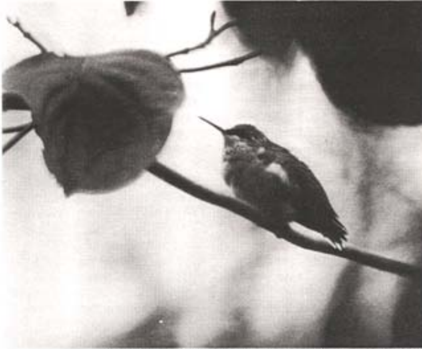
Immature male Ruby-throated Hummingbird -Akron, Ohio 19 Oct., 1990

21 Oct. (Hannikman). The Klamms found another being harassed by crows at Lakewood Park.