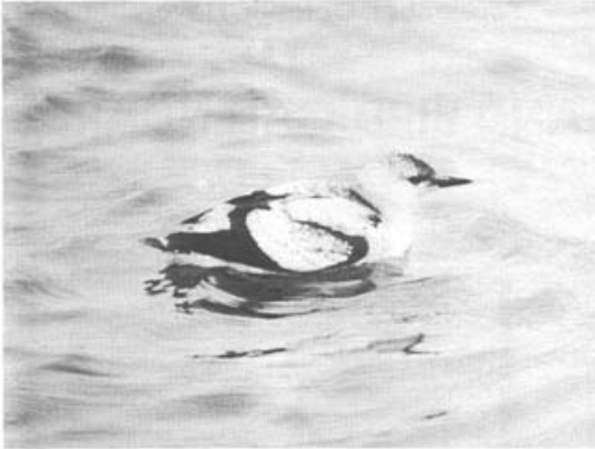
Black Guillemot - 9 November 1990 - Cleveland, Ohio