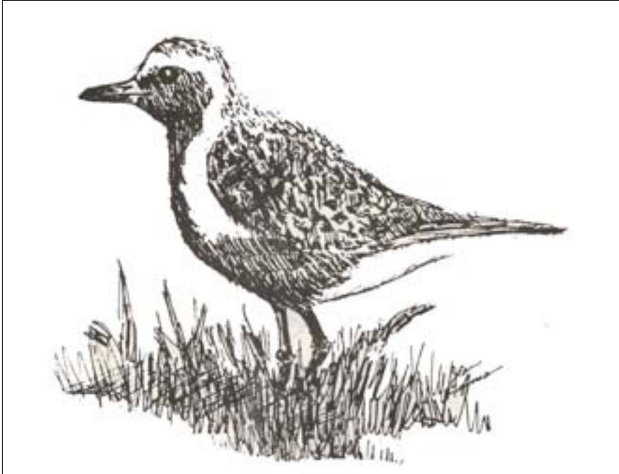
Black-bellied Plover