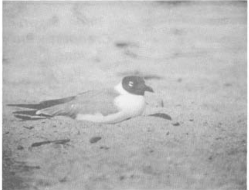
Laughing Gull, 1 July 1990 Headlands Beach SP

Caspian Terns were observed in reduced numbers along Lake Erie. This was especially evident in Lorain, where a high tally was a paltry 14 on 14 Aug. Two birds at Baldwin Lake and two at Shaker Lakes provided the only inland reports. Common Terns were abundant in Lorain and at Headlands BSP in August. At the beginning of August at Headlands BSP, both Common and Forster's Terns were in the same small numbers. As the month wore on, a remarkable buildup of Commons was staged. A total of 500 was estimated on 25 Aug. Klamm counted 120 in Lorain on 27 Aug. A first-summer plumaged Forster's Tern was unique at Headlands BSP on 8 July (Hannikman, Rosche). Unique because individuals of this age reportedly do not leave their wintering grounds. Up to 18 Forster's Terns were reported from Lorain in July. Another 16 were in Rocky River. Two Black Terns seemed out of place at West Branch SP on 17 July (Wert). Small numbers were appearing along Lake Erie by mid-August.