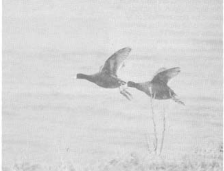
American Coots by Victor Fazio III

North Park Boulevard is another quiet stretch until the trail moves away from the road into a mixed woods. Apart from a grackle colony, the pines here are ornithologically dull. In contrast, another excellent migrant gathering point is along the woody margins of the peninsula that juts into the lake. The view of the lake is comprehensive from here, and is one of the better spots to watch swallows. The final leg of the circuit requires close exami-