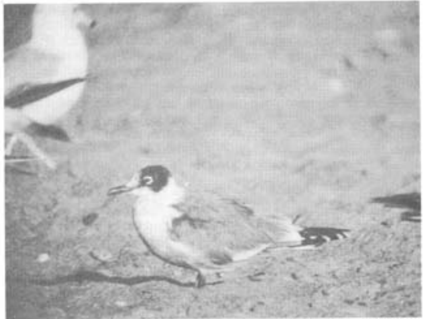
Franklin's Gull, 16 June 1990 Headlands Beach State Park

Orchard Orioles were noted in the usual Portage and Summit County locations. Reports from Lake Medina on 1 June (Witt), Hinckley on 10 June (Harlan), along the Grand River on 16 June, and Hiram Rapids on 24 June were from new locations. Northern Orioles were common throughout the region. A male Purple Finch at Brecksville Reservation on 2 July was good for the location. Hahn and Kiwi located only 8 in their field study at Holden Arboretum. Young were noted in Twin Lakes on 26 July (Rosche).