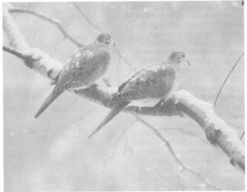
Mourning Doves by Victor Fazio III

Horseshoe Lake is open along the west and rimmed along the east with tall mixed deciduous/conifer stands. On summer weekends, the woods see little pedestrian traffic compared to Lower Lake. Much of my time covering Horseshoe Lake is spent in the area of the feeder streams looking for migrant flocks of warblers. The edges of Horseshoe Lake are easy to walk through, and the south side of both streams gives the birder an elevated view of the area. The tall oak trees of the picnic area may be active during a wave day with dozens of birds. The 75-ft. canopy generally precludes satisfactory observation. The point projecting into Horseshoe Lake is easy to