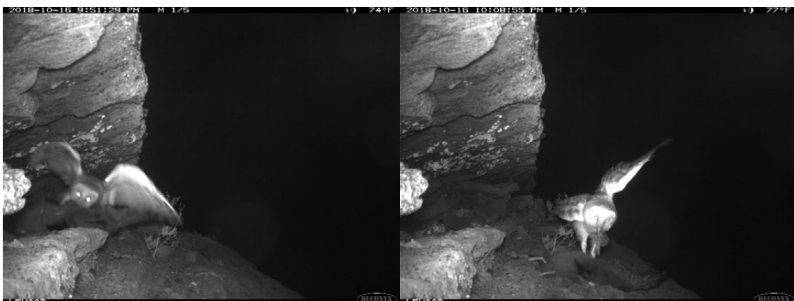
Fig. 5. Burrow camera footage of a Barn Owl pulling a Wedge-tailed Shearwater chick out of its burrow on Lehua Islet and depredating it.