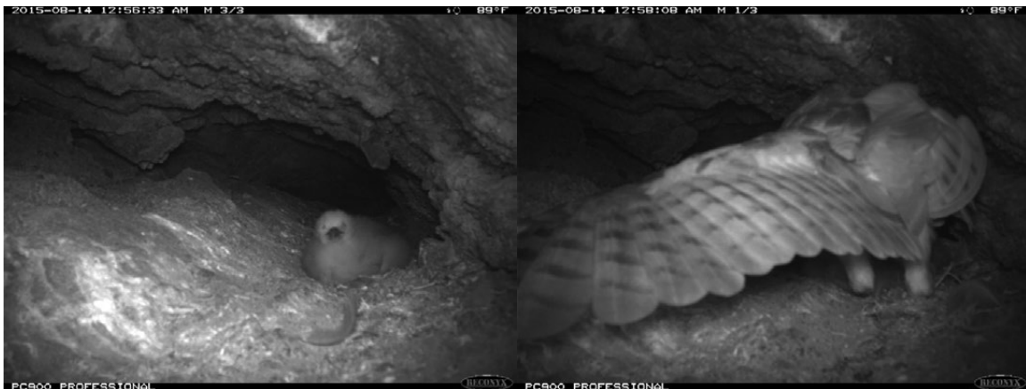
Fig. 4. Burrow camera footage of a Barn Owl entering a Wedge-tailed Shearwater burrow on Lehua Islet to depredate a chick.