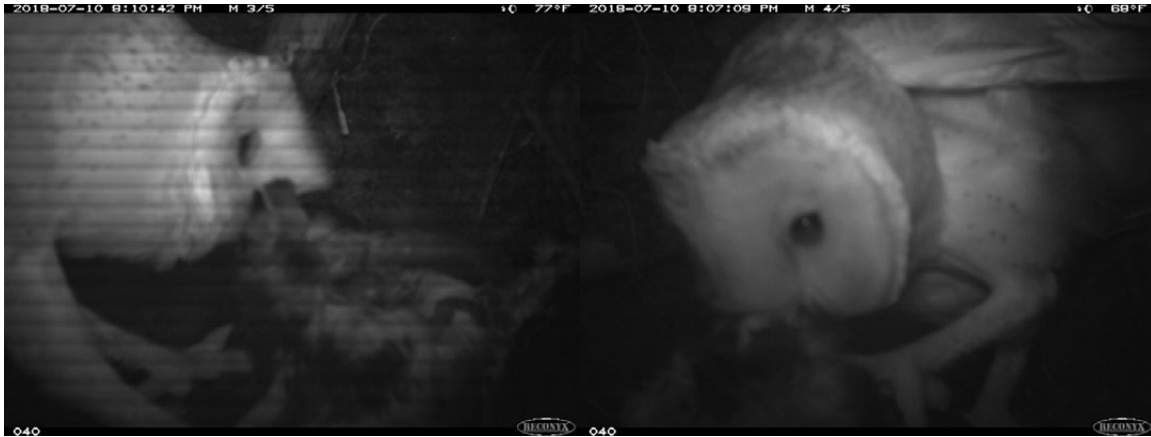
Fig. 3. Burrow camera footage of a Barn Owl depredating a Newell's Shearwater adult at its burrow in the Upper Limahuli Preserve.

or 1.13 km 2 ), Lehua Islet could support a large number of owls (11 were removed in a single year while several individuals were known to be present after the control treatment ended). Our data suggest that Barn Owls are resilient and are capable of rapid recolonization on the islet, probably from source populations on neighboring Ni'ihau or Kaua'i. A Barn Owl nest site on Lehua that was regularly targeted for control work yielded clutches of eggs or chicks within a few months of control operations on multiple occasions, highlighting how quickly owl pairs can re-lay on the