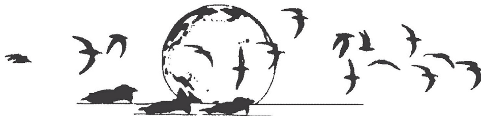
Pacific Seabird Group