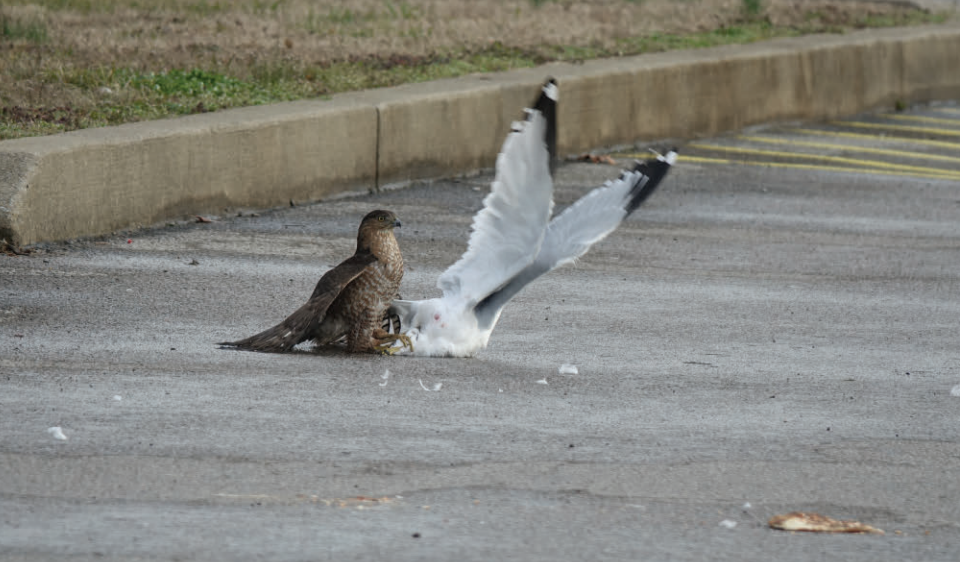
Figure 1. A Cooper's Hawk attacking a Ring-billed Gull at J. Percy Priest Dam parking lot in Davidson County.