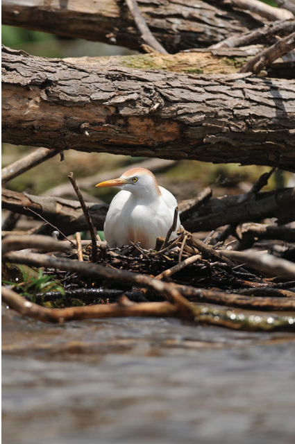
Figure 1. This is the first ground nesting documentation of Cattle Egret in Tennessee.

previously documented nesting on branches laid horizontally on the adjacent duck blind, but I had not previously observed any Great or Snowy Egret nests on the ground on the island. In addition to ground nesting egrets, a Double-crested Cormorant nest was also documented for the first time nesting on the ground on the island.