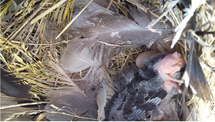
Figure 1. Newly hatched Tree Swallow chick next to its 7-day old nest mate. Three of the four remaining unhatched eggs are also visible.