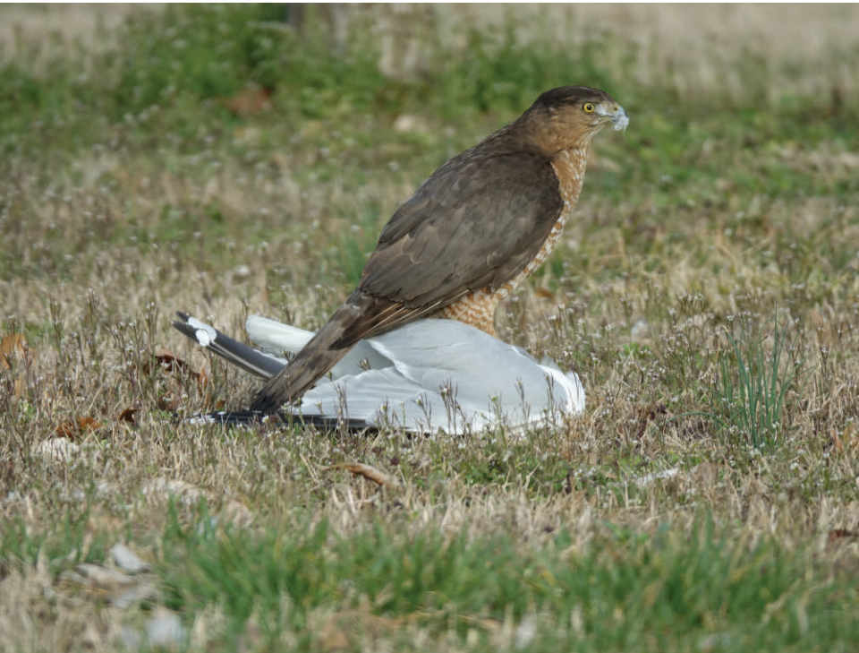
Figure 2. Over a few minutes, the Cooper's Hawk managed to overcome the Ring-billed Gull.